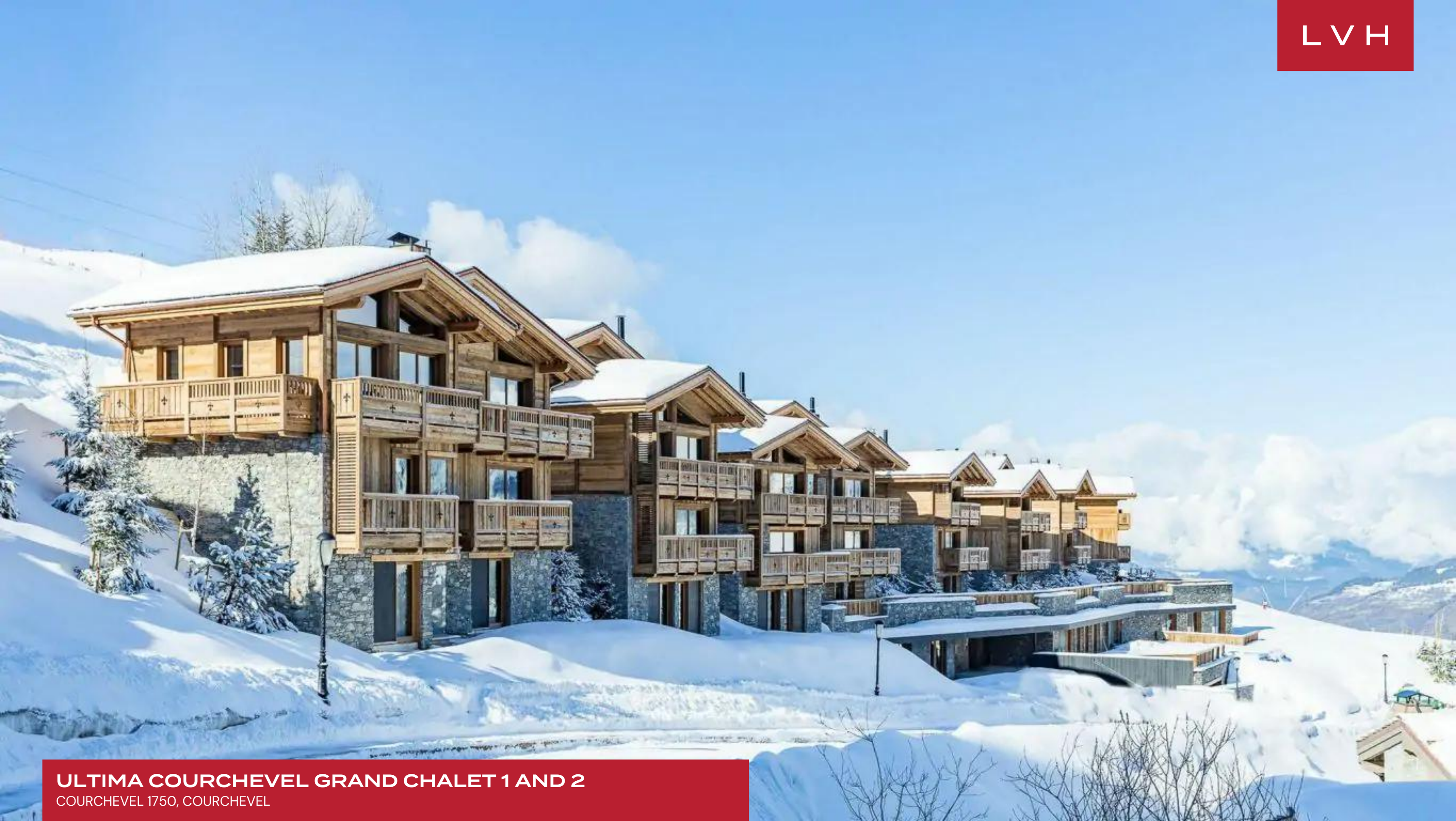
ULTIMA COURCHEVEL GRAND CHALET 1 AND 2 COURCHEVEL 1750, COURCHEVEL