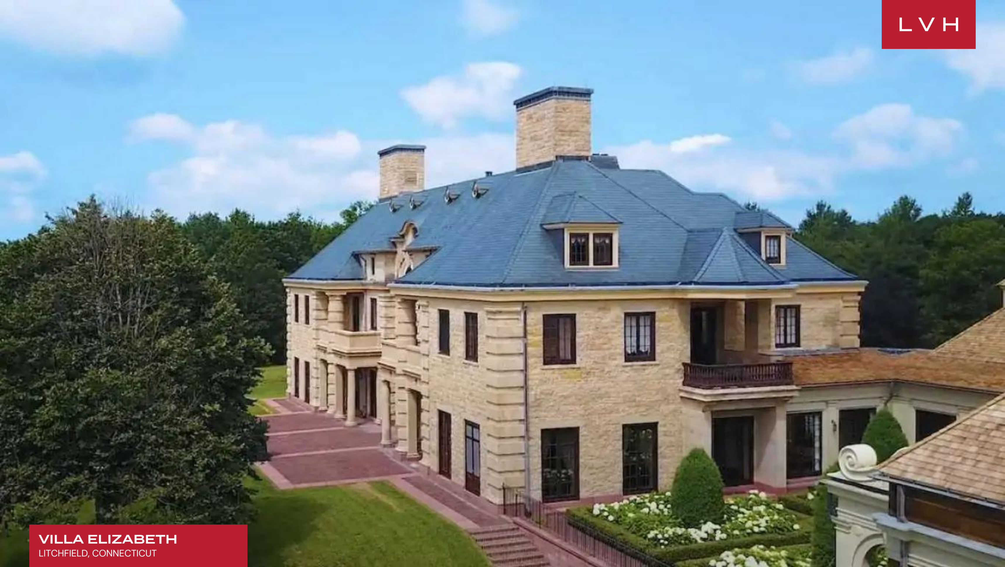
VILLA ELIZABETH LITCHFIELD, CONNECTICUT