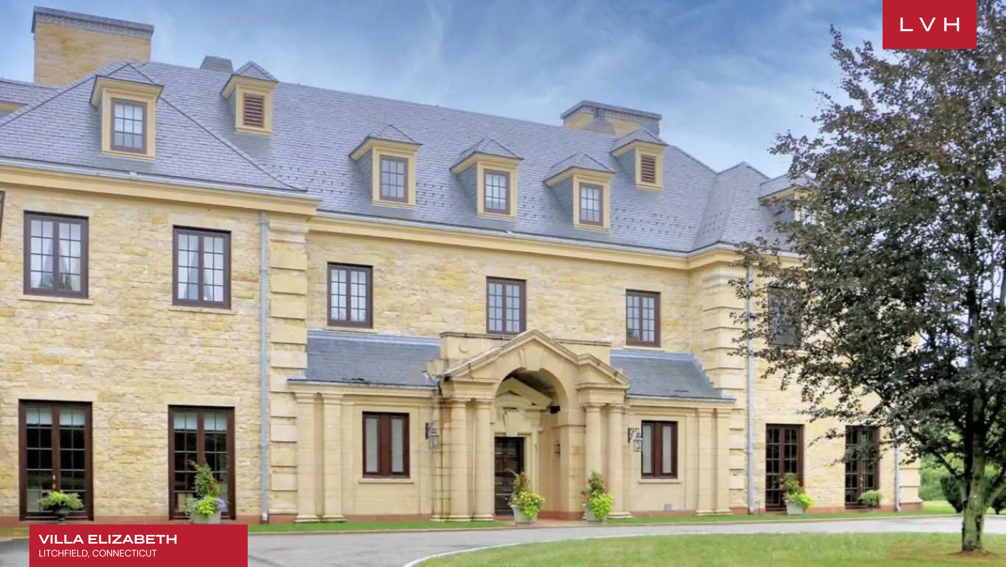
VILLA ELIZABETH LITCHFIELD, CONNECTICUT