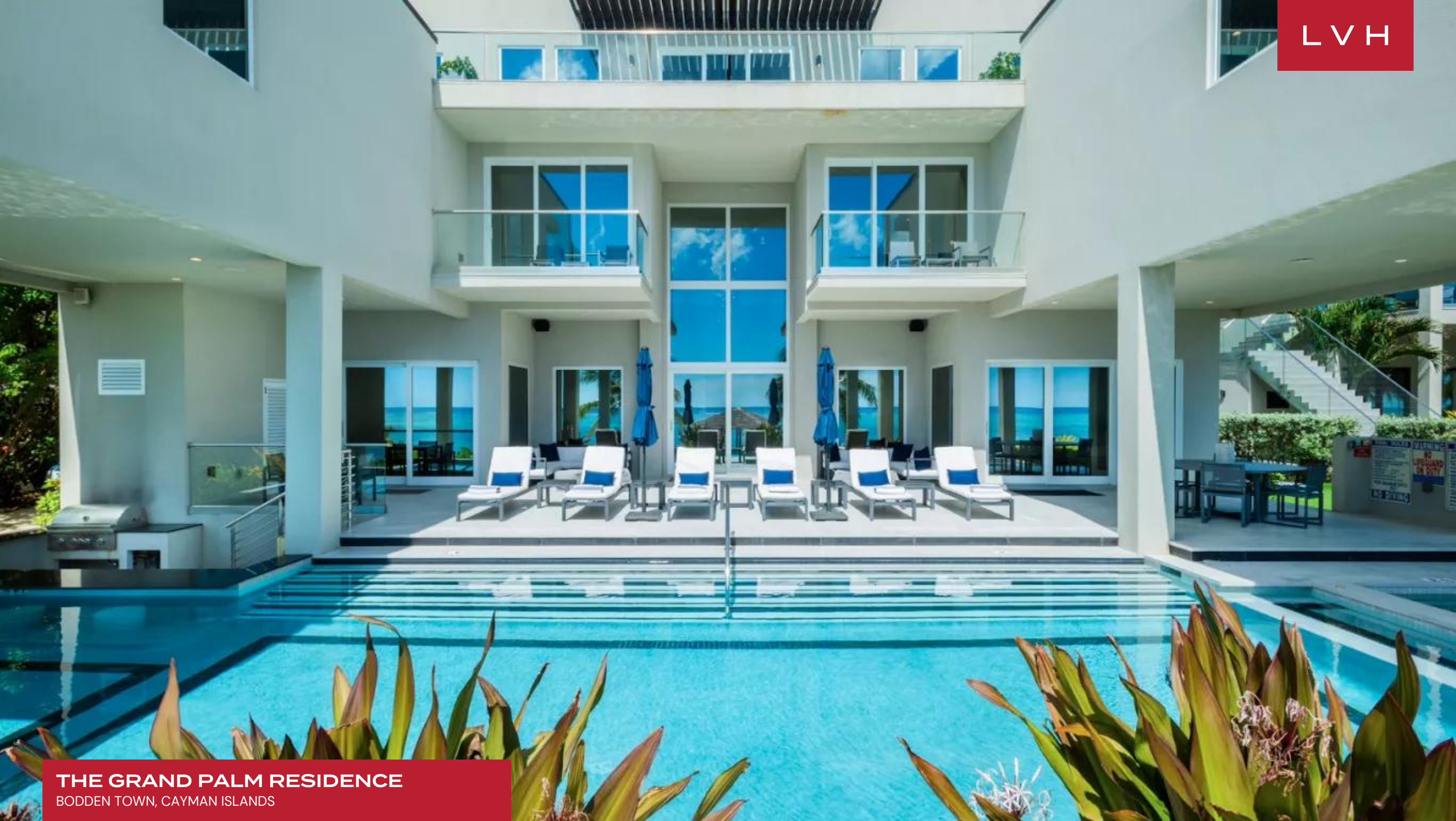
THE GRAND PALM RESIDENCE BODDEN TOWN, CAYMAN ISLANDS