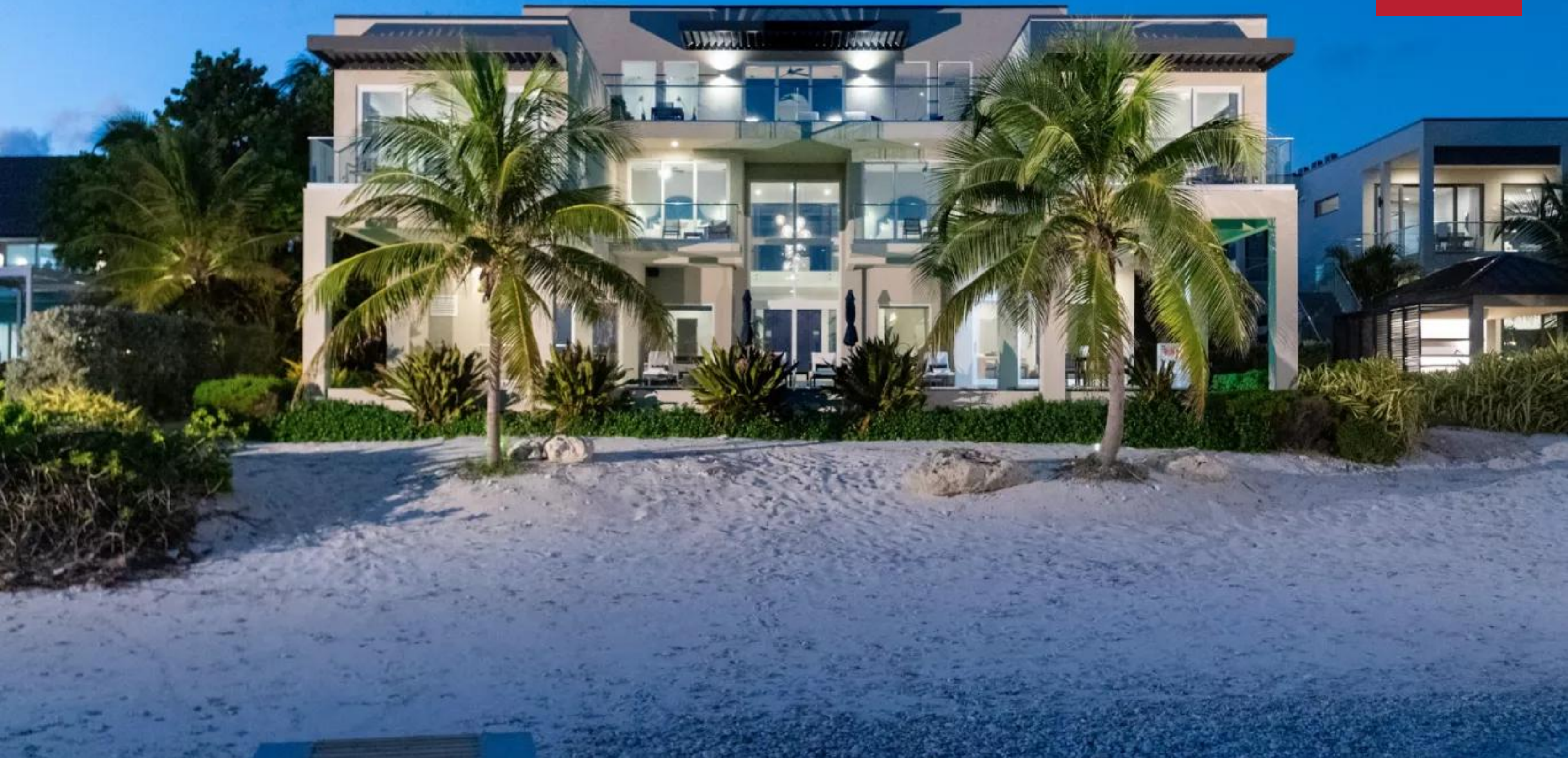
THE GRAND PALM RESIDENCE BODDEN TOWN, CAYMAN ISLANDS