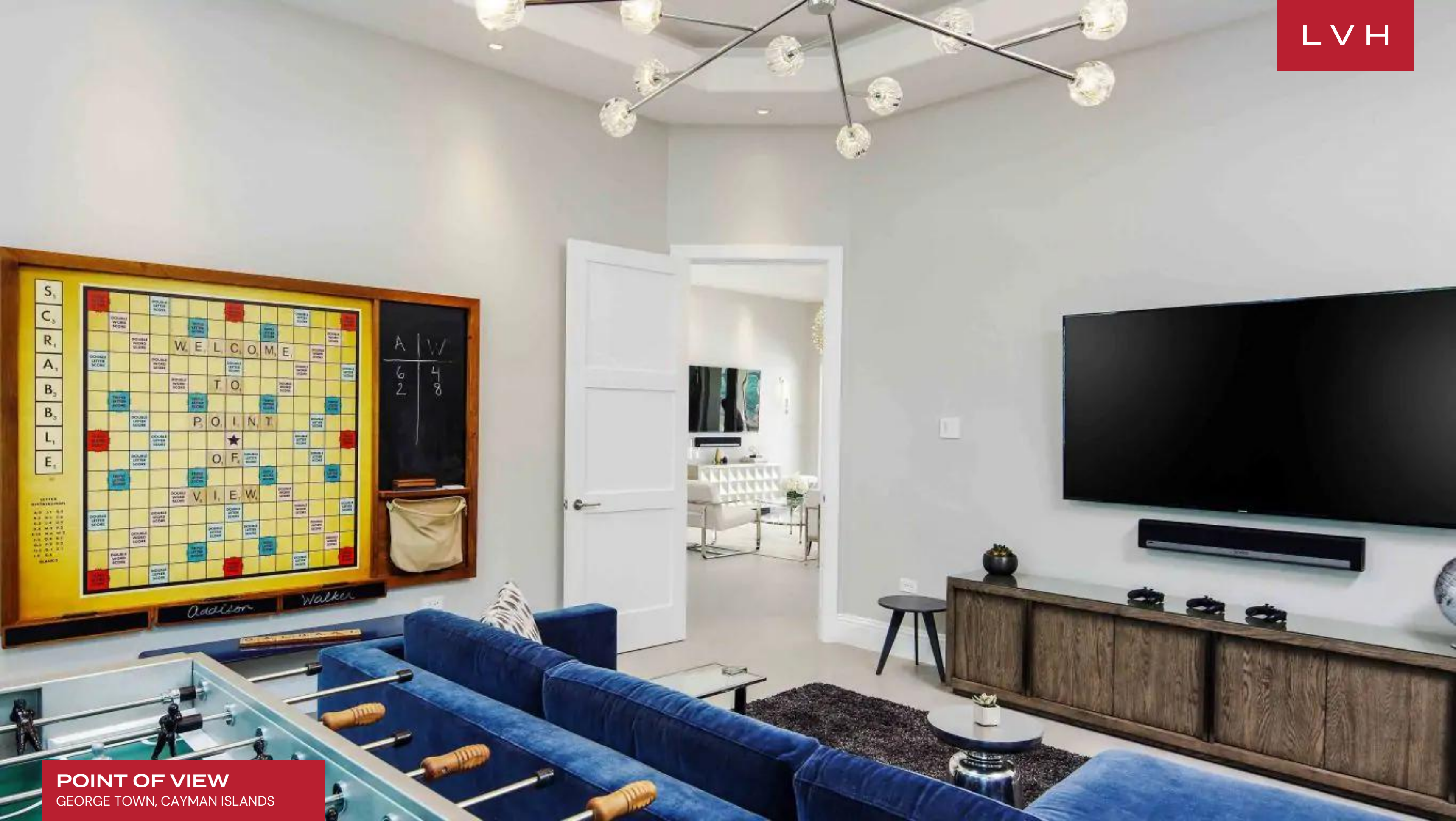
POINT OF VIEW GEORGE TOWN, CAYMAN ISLANDS