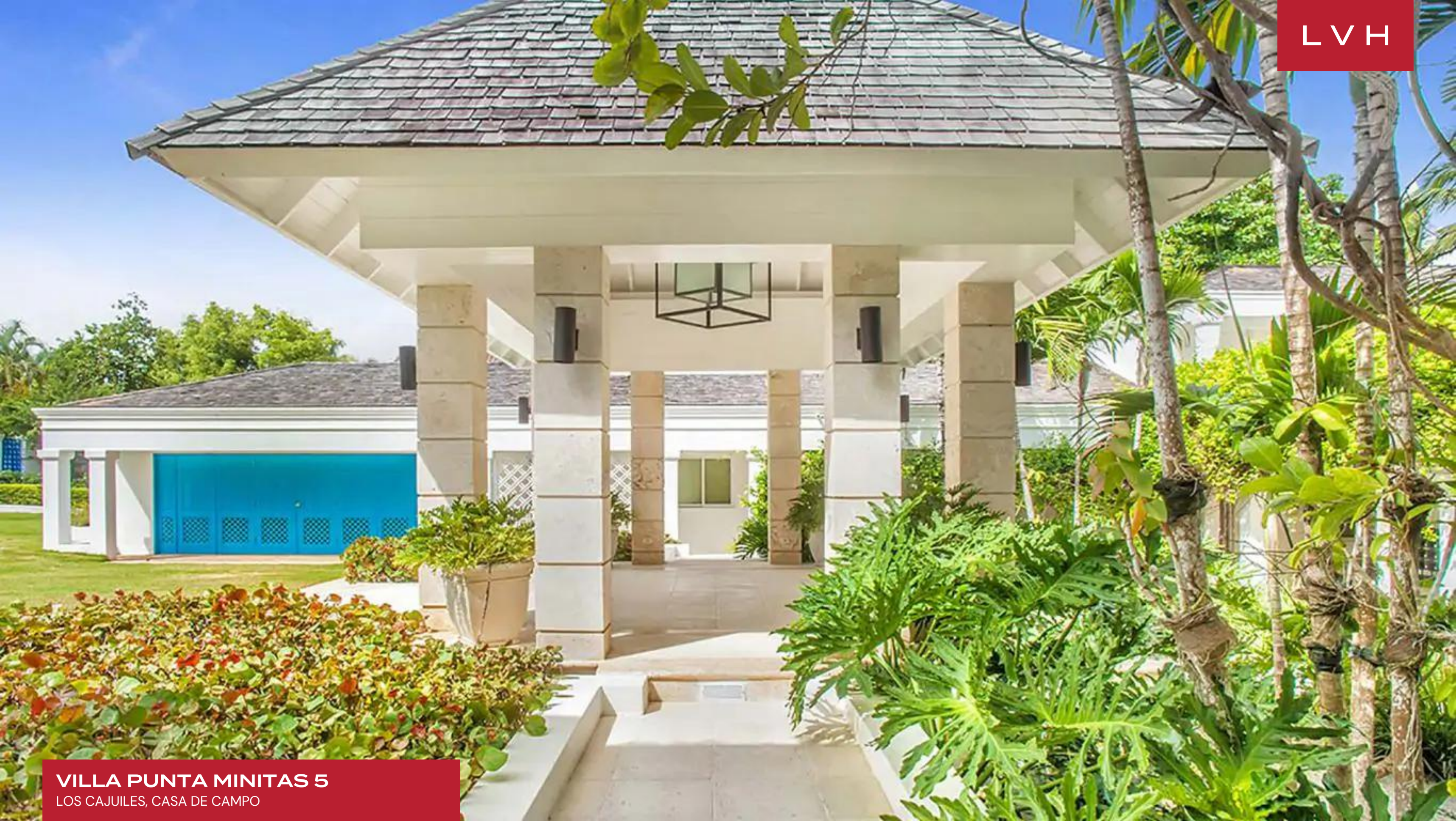
VILLA PUNTA MINITAS 5 LOS CAJUILES, CASA DE CAMPO