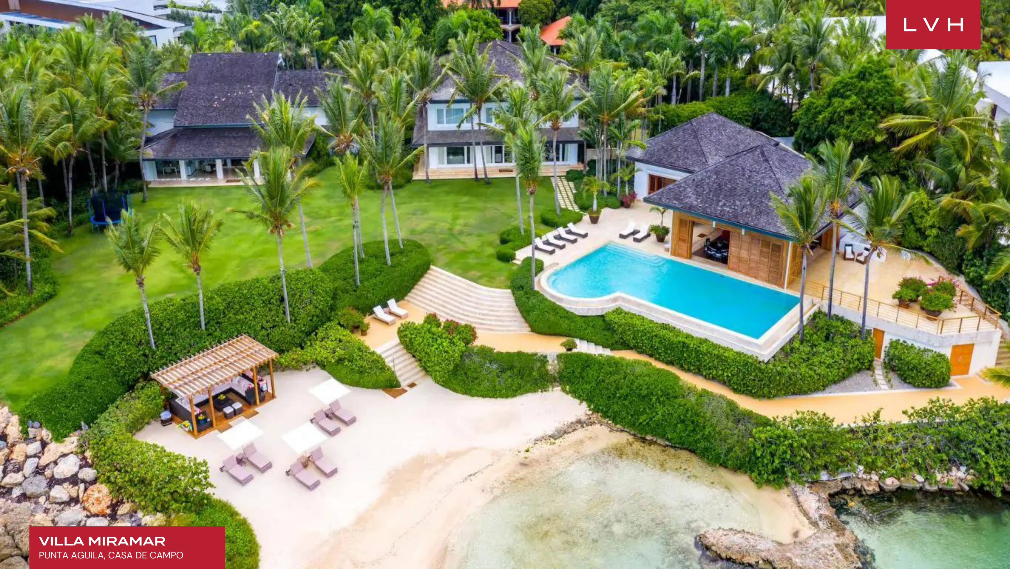
VILLA MIRAMAR PUNTA AGUILA, CASA DE CAMPO