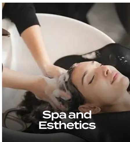
Spa and Esthetics