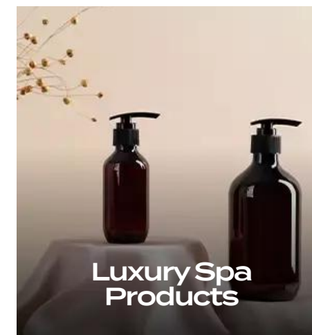
Luxury Spa Products