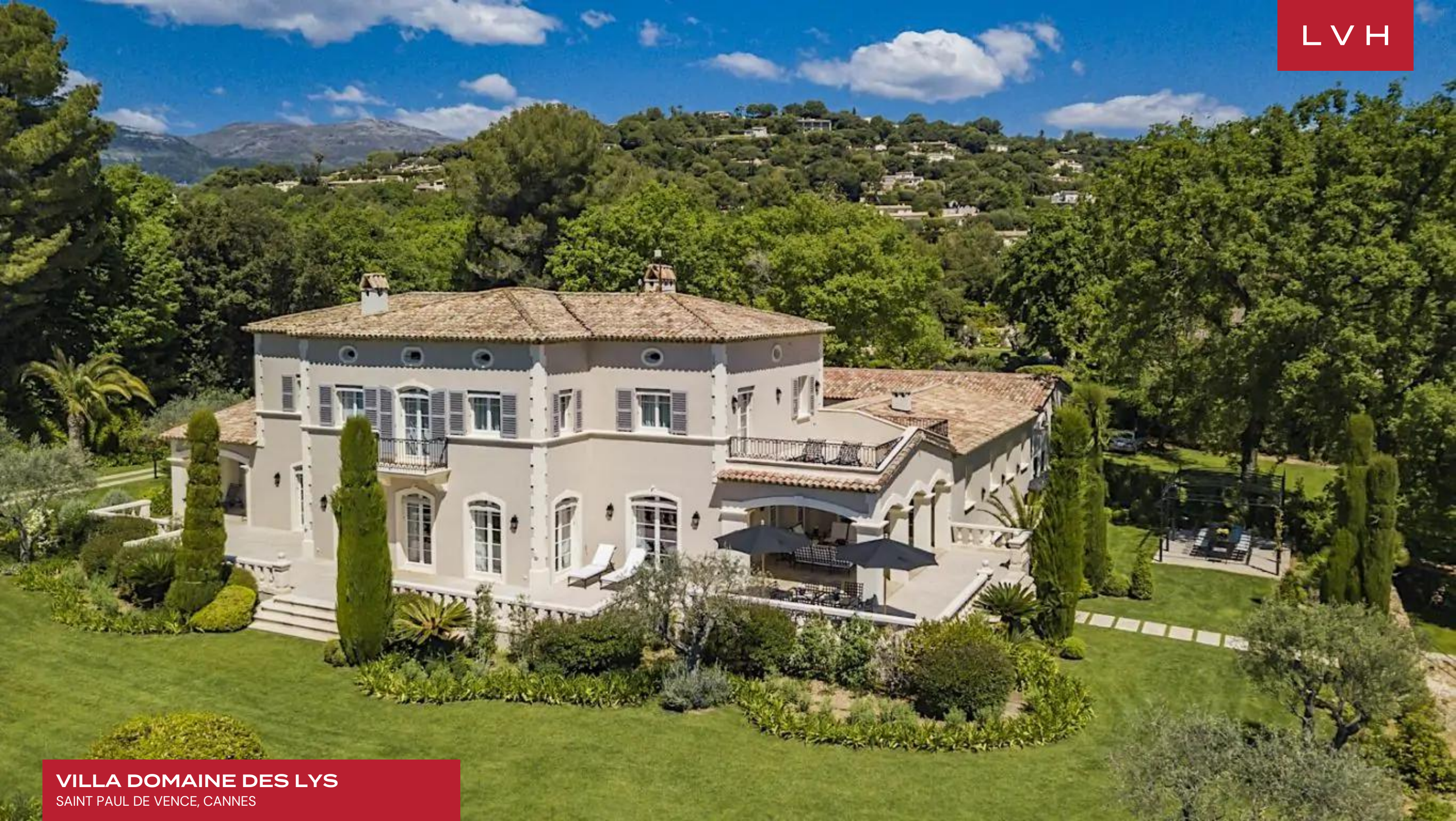
VILLA DOMAINE DES LYS SAINT PAUL DE VENCE, CANNES