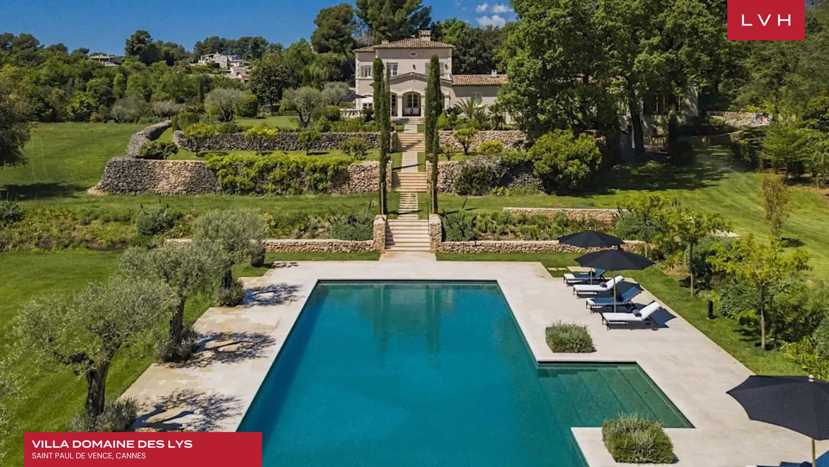
VILLA DOMAINE DES LYS SAINT PAUL DE VENCE, CANNES