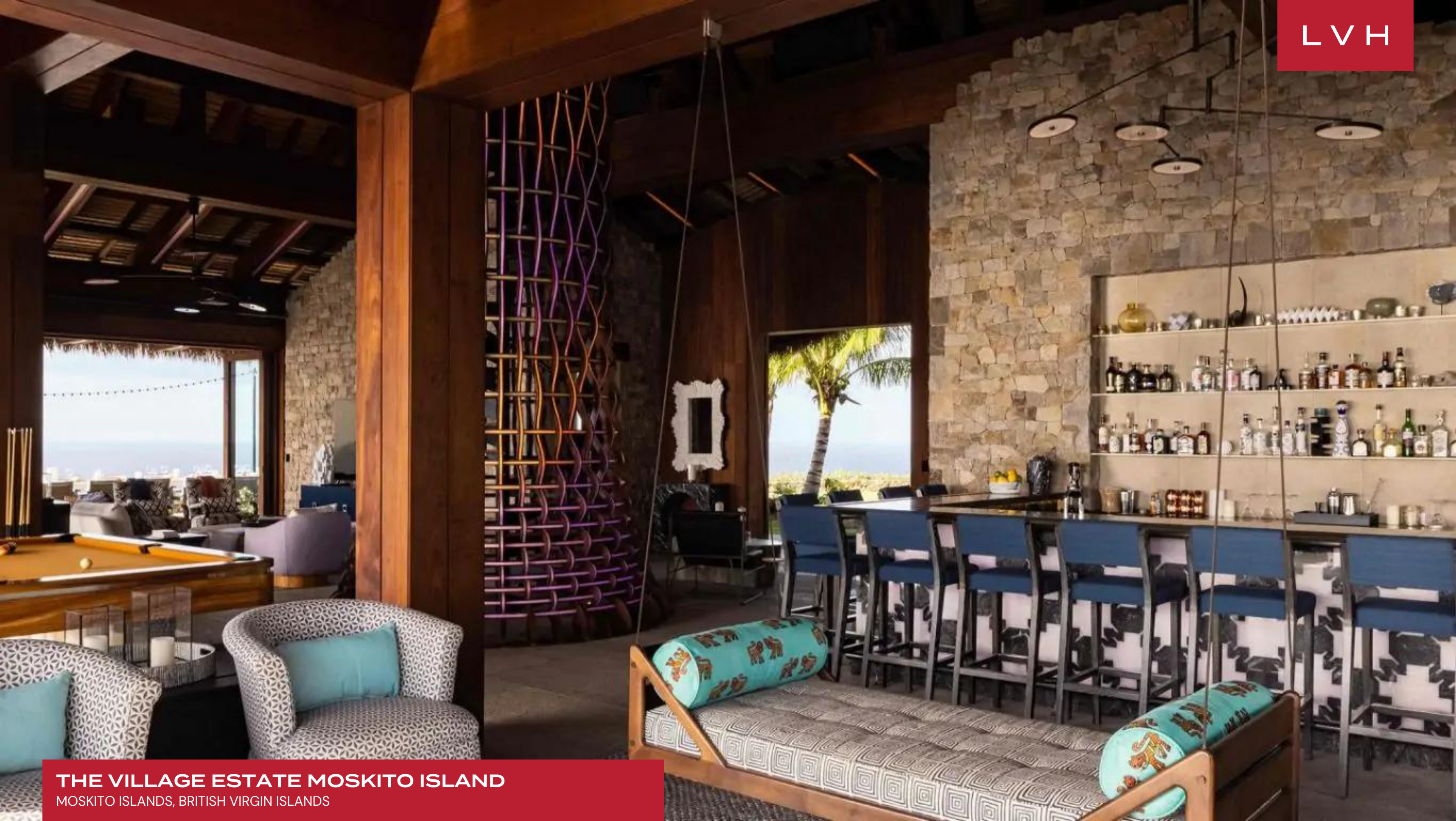
THE VILLAGE ESTATE MOSKITO ISLAND MOSKITO ISLANDS, BRITISH VIRGIN ISLANDS