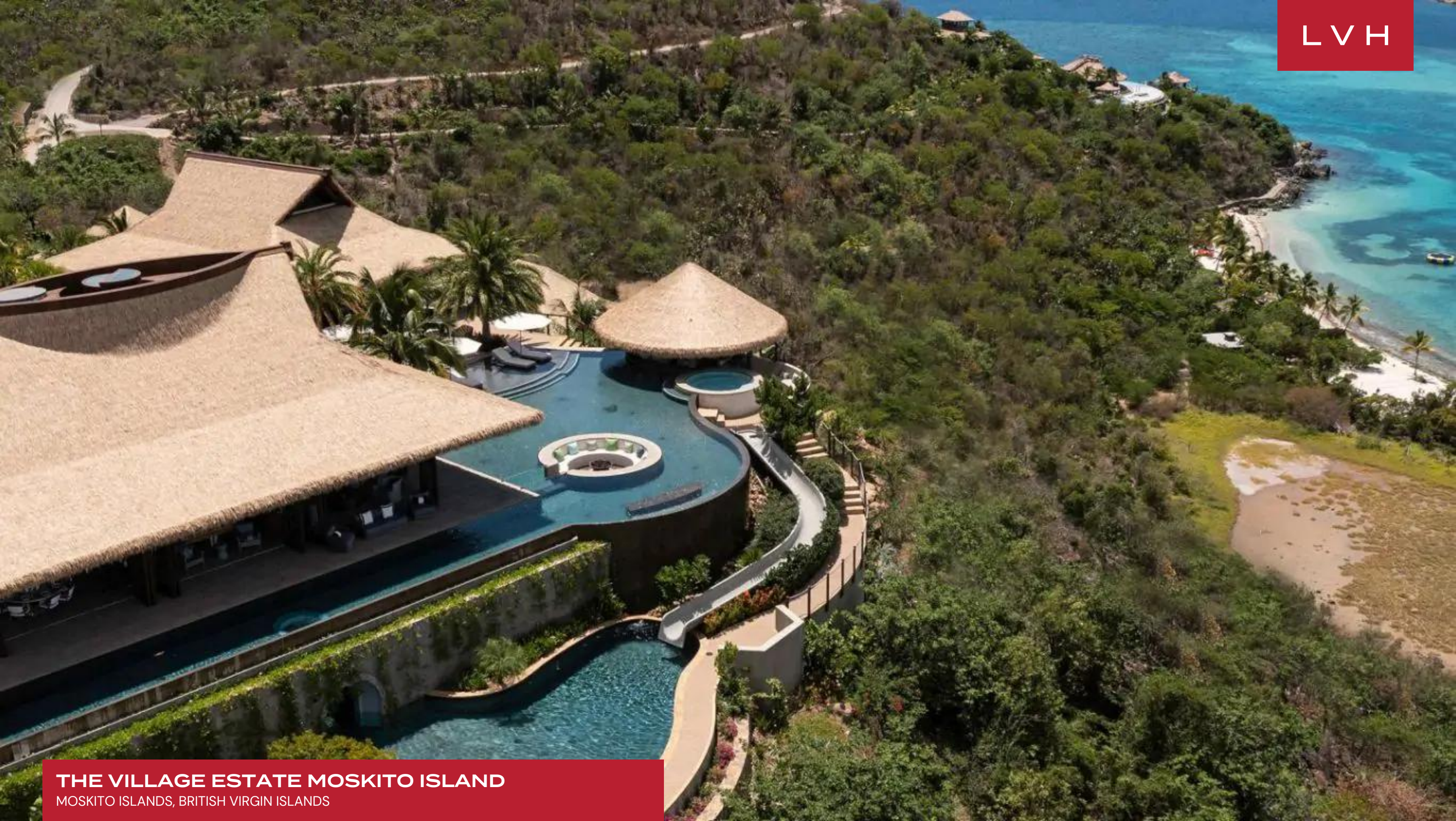
THE VILLAGE ESTATE MOSKITO ISLAND MOSKITO ISLANDS, BRITISH VIRGIN ISLANDS