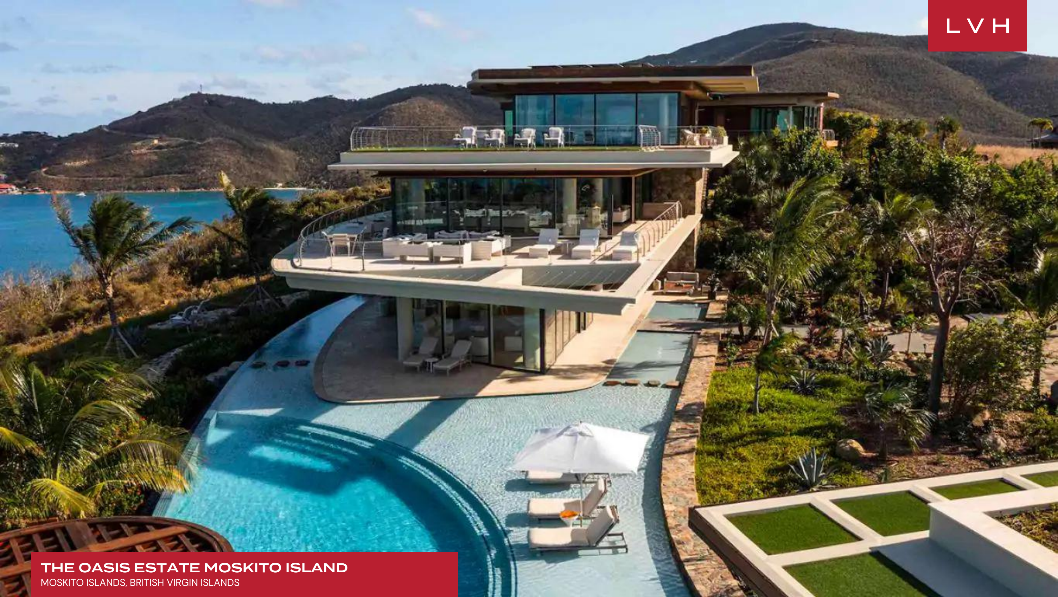
THE OASIS ESTATE MOSKITO ISLAND MOSKITO ISLANDS, BRITISH VIRGIN ISLANDS