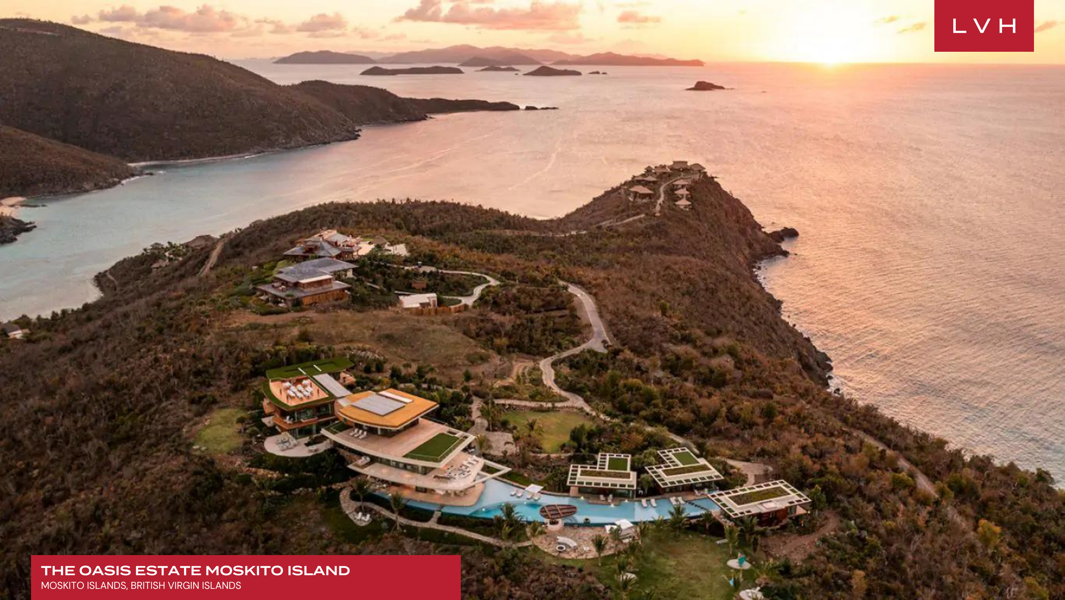
THE OASIS ESTATE MOSKITO ISLAND MOSKITO ISLANDS, BRITISH VIRGIN ISLANDS