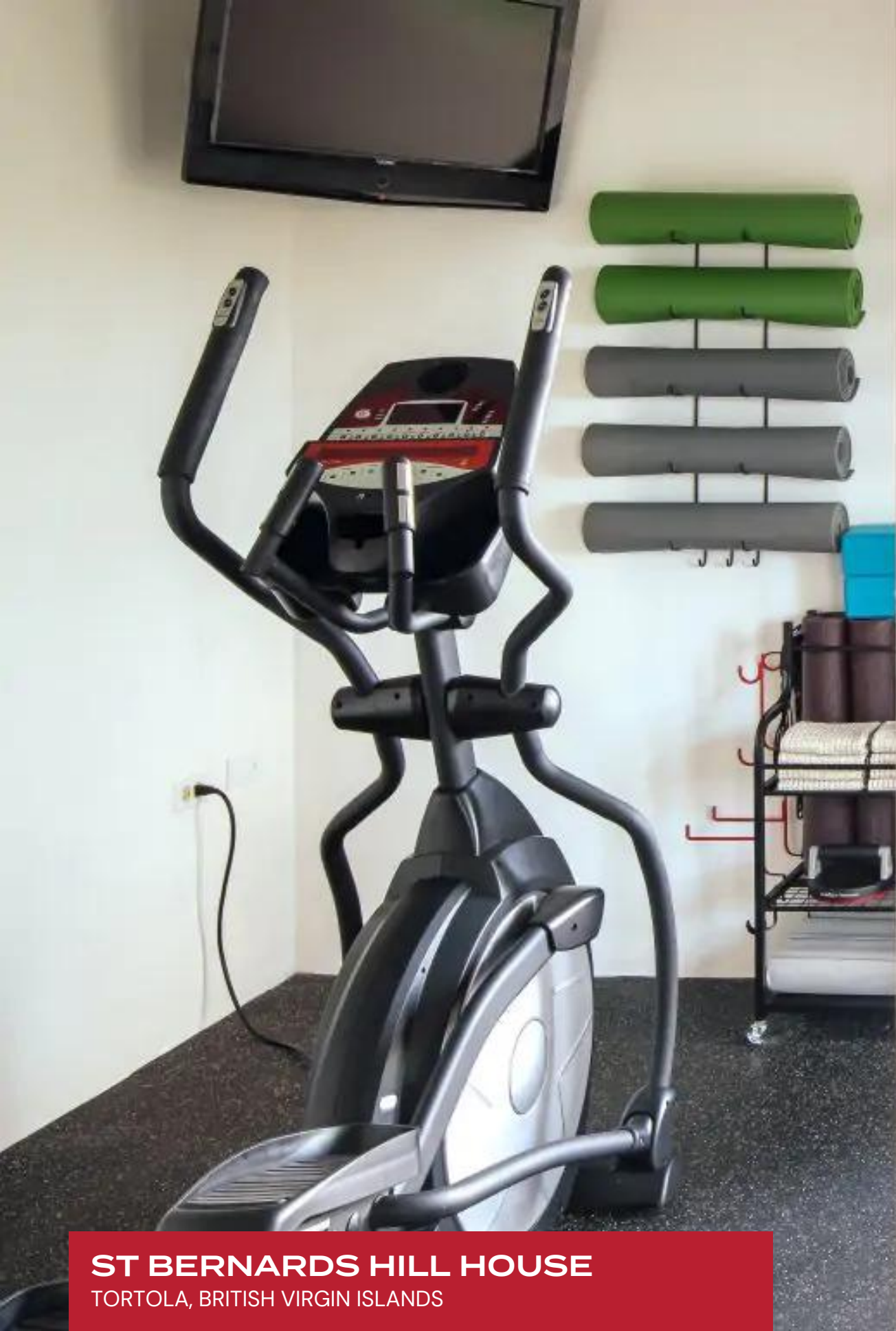
ST BERNARDS HILL HOUSE TORTOLA, BRITISH VIRGIN ISLANDS