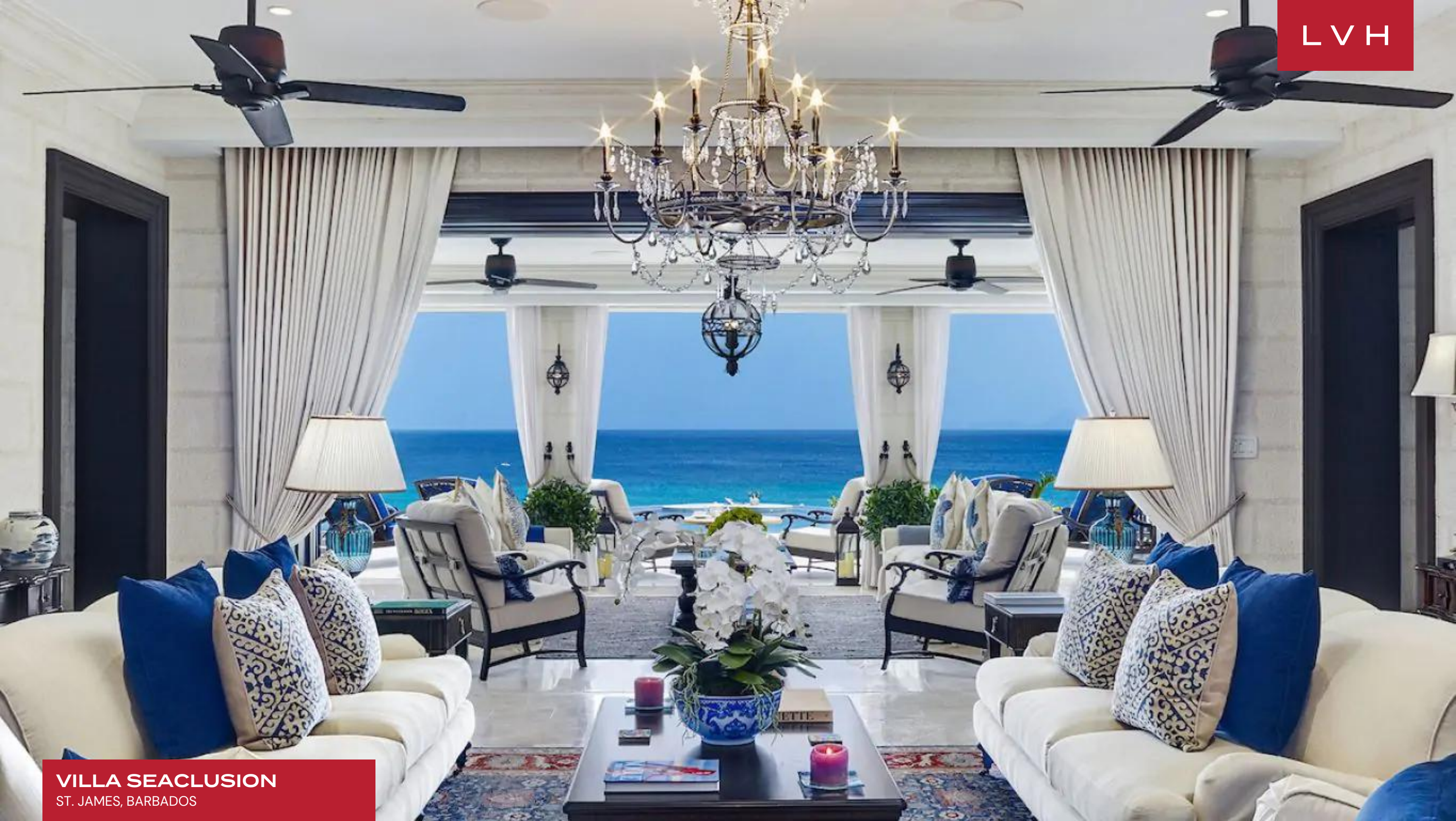
VILLA SEACLUSION ST. JAMES, BARBADOS