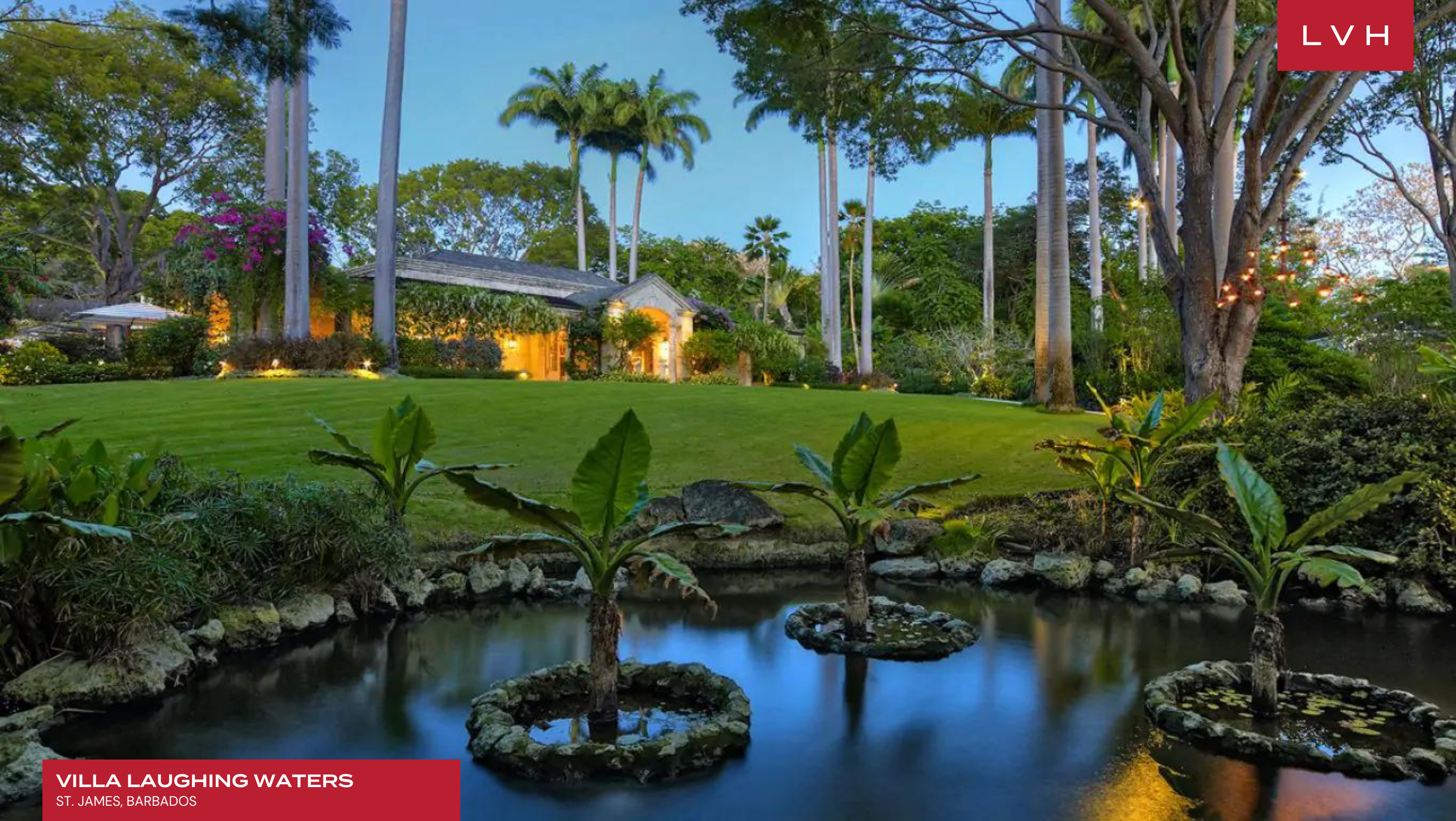
VILLA LAUGHING WATERS ST. JAMES, BARBADOS