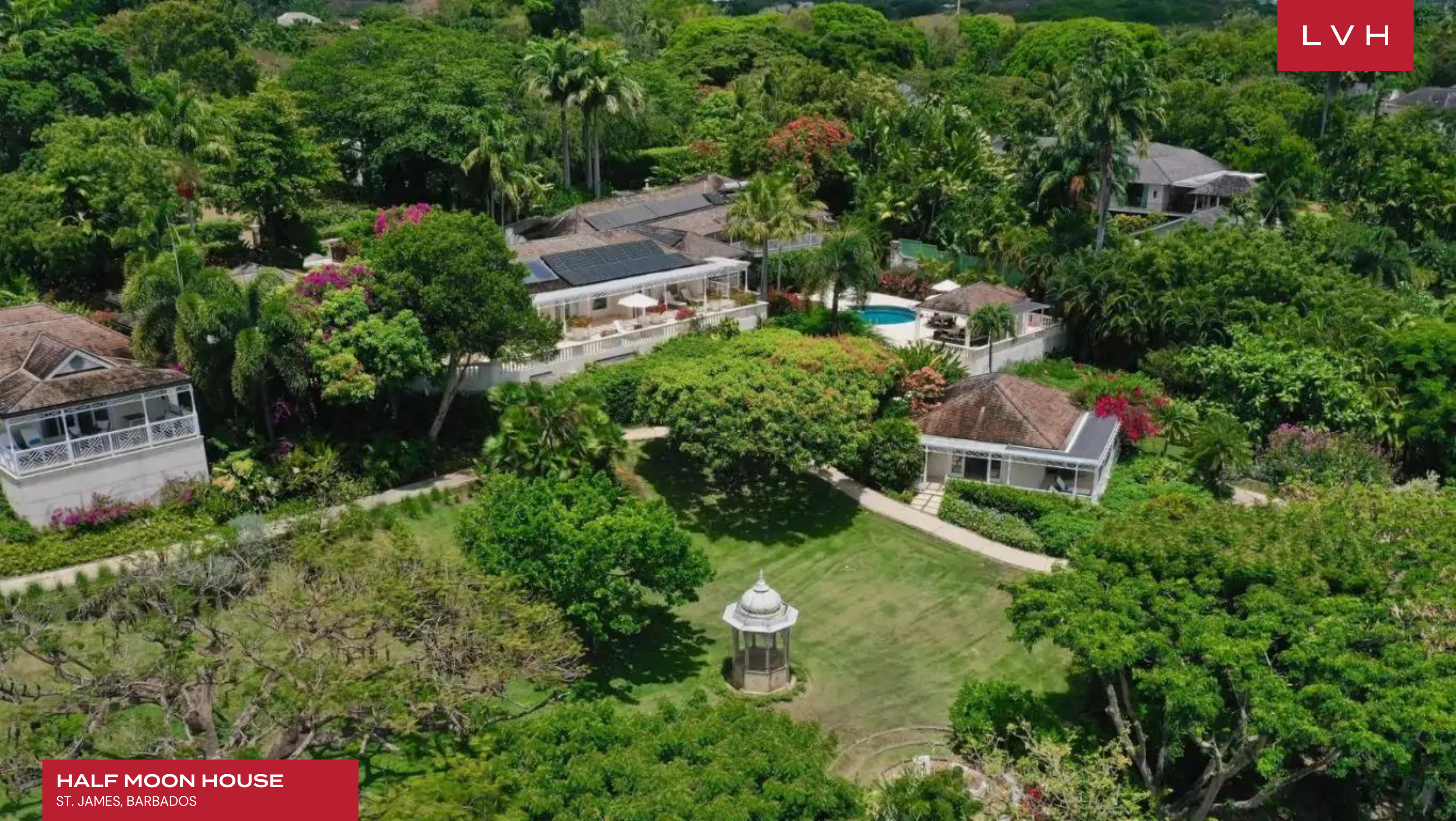
HALF MOON HOUSE ST. JAMES, BARBADOS