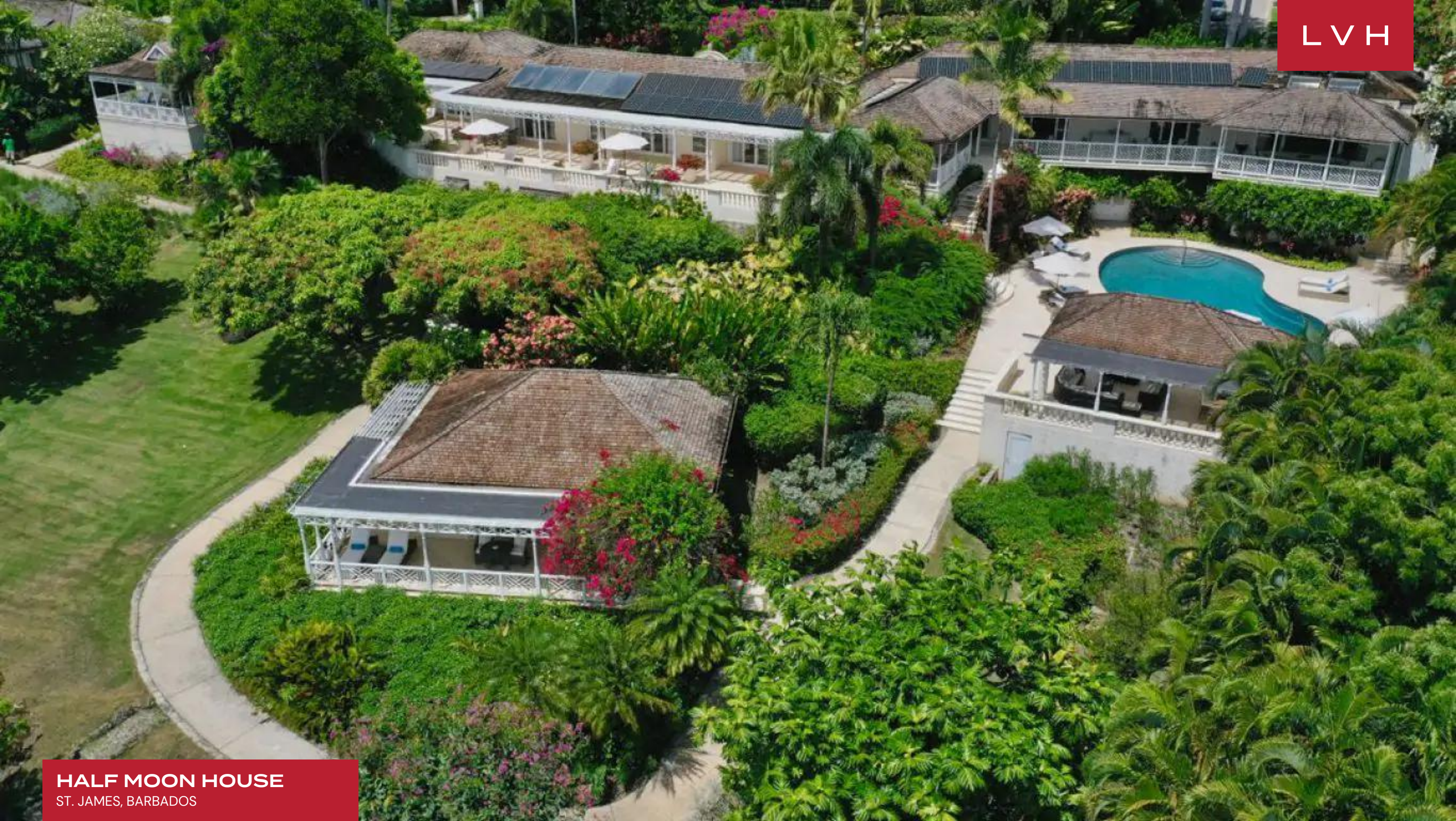
HALF MOON HOUSE ST. JAMES, BARBADOS