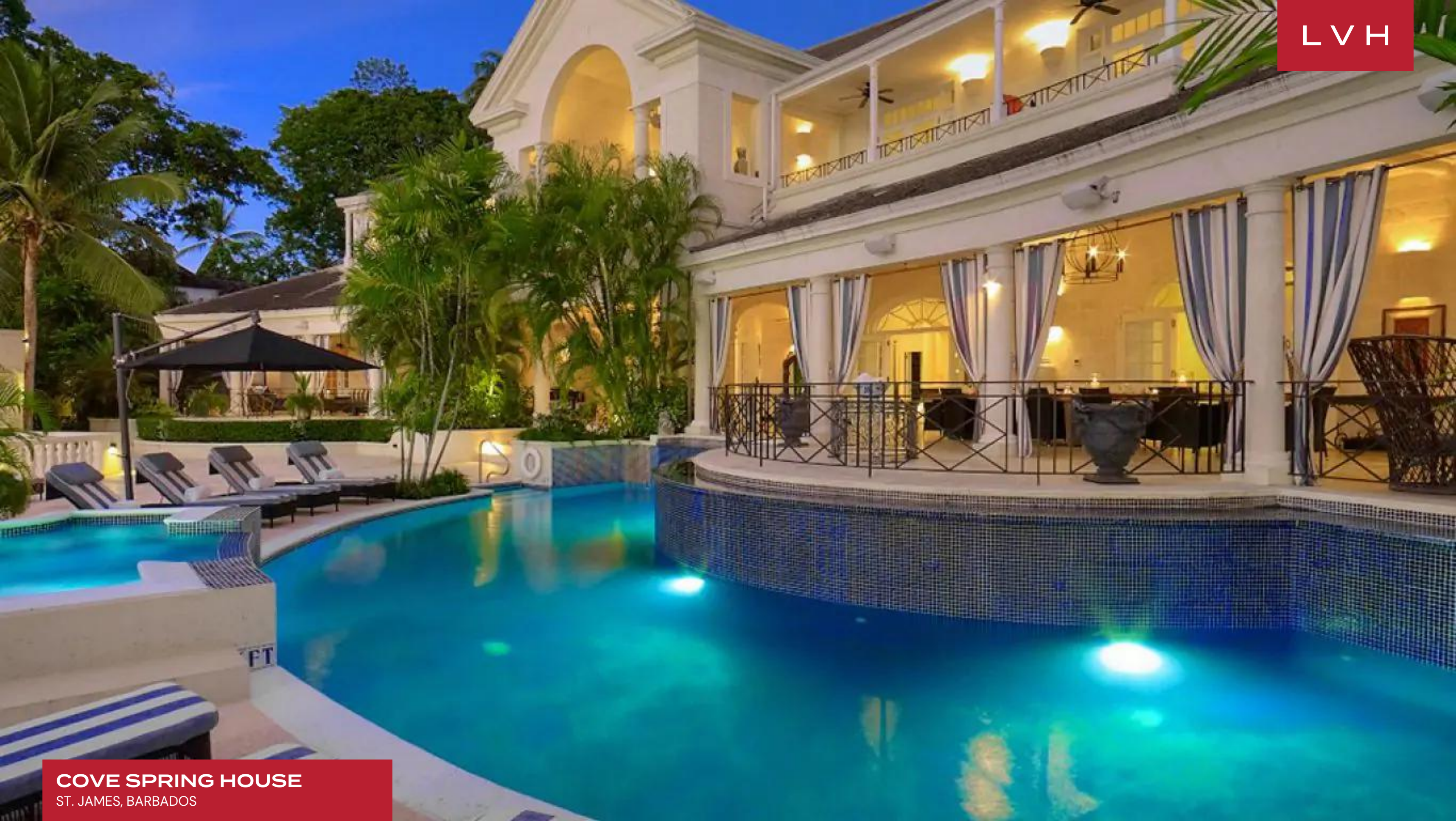
COVE SPRING HOUSE ST. JAMES, BARBADOS