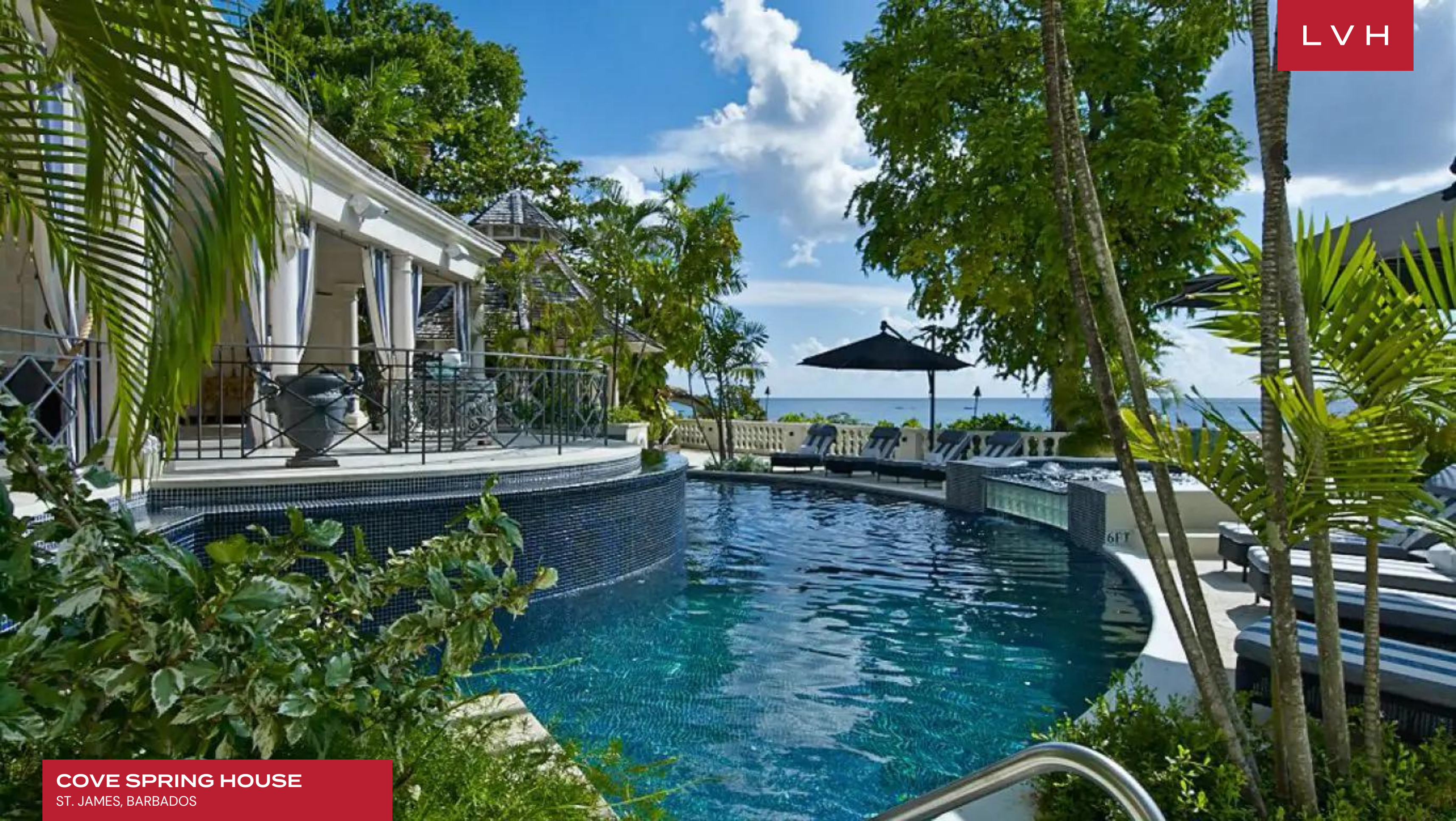
COVE SPRING HOUSE ST. JAMES, BARBADOS