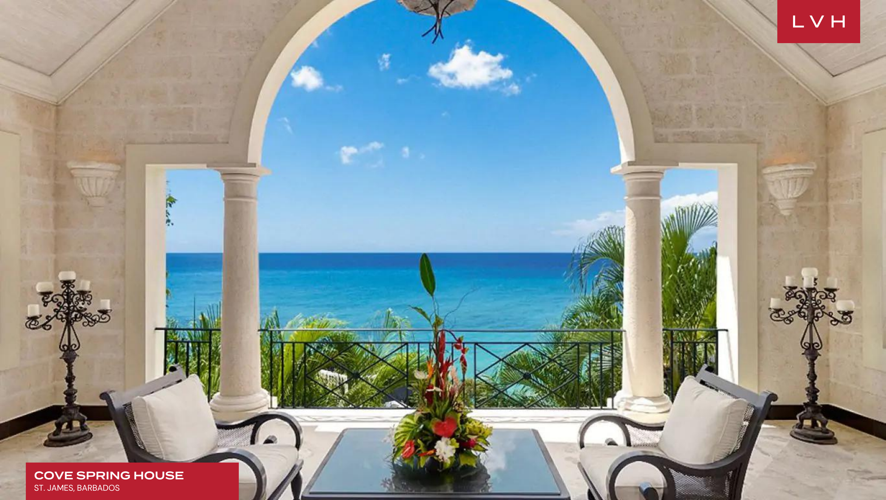
COVE SPRING HOUSE ST. JAMES, BARBADOS