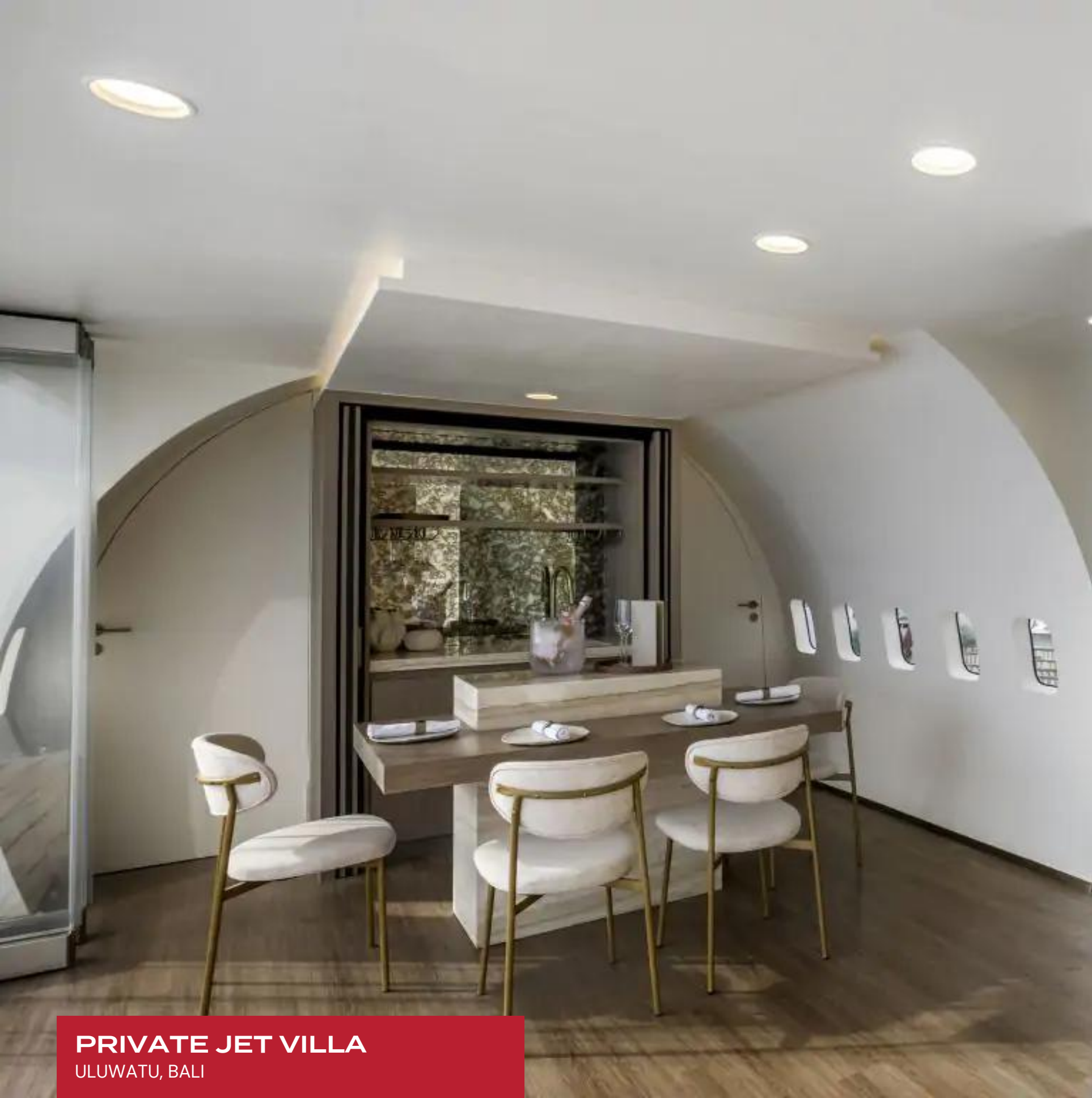
PRIVATE JET VILLA ULUWATU, BALI