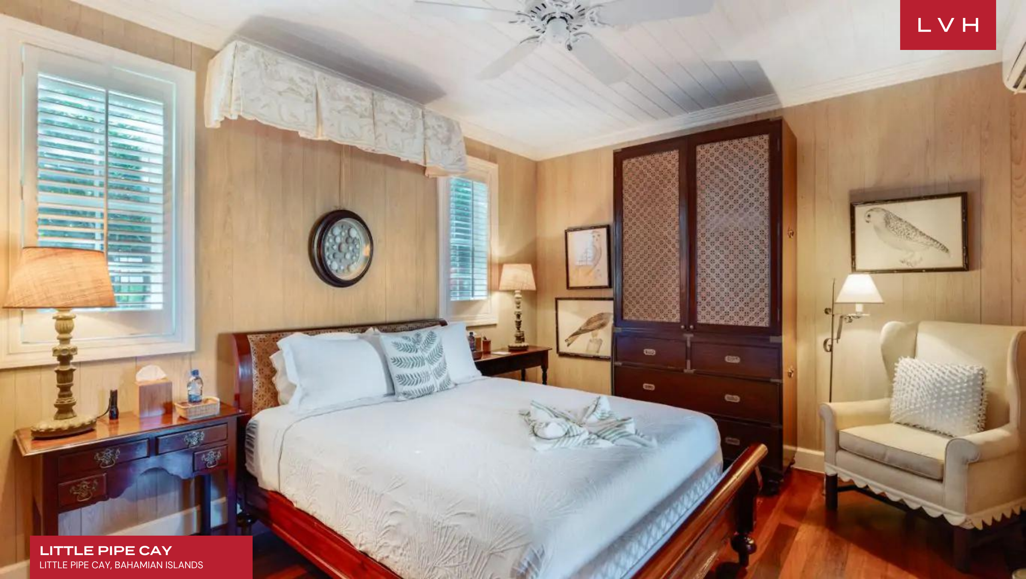
LITTLE PIPE CAY