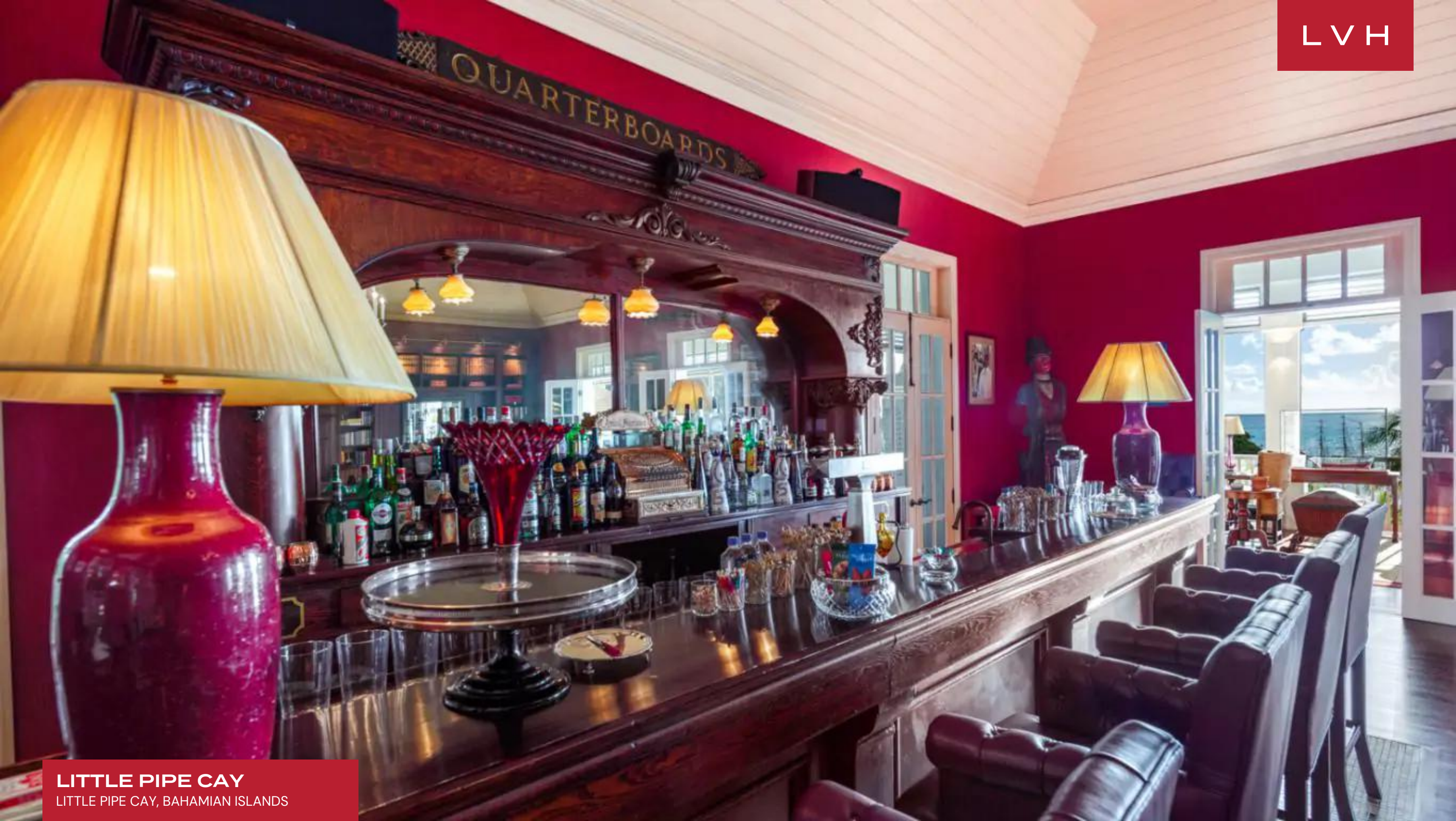
LITTLE PIPE CAY LITTLE PIPE CAY, BAHAMIAN ISLANDS