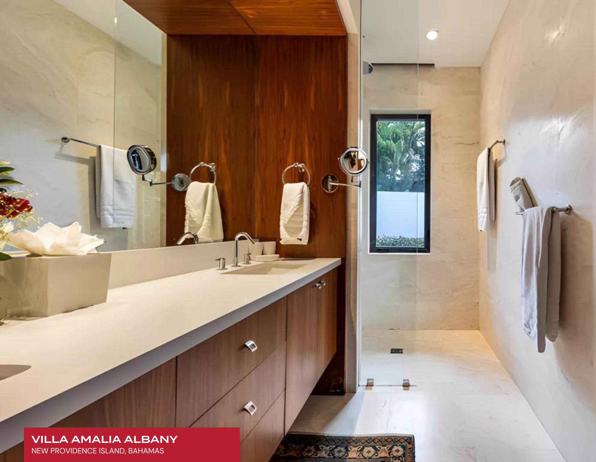
VILLA AMALIA ALBANY NEW PROVIDENCE ISLAND, BAHAMAS