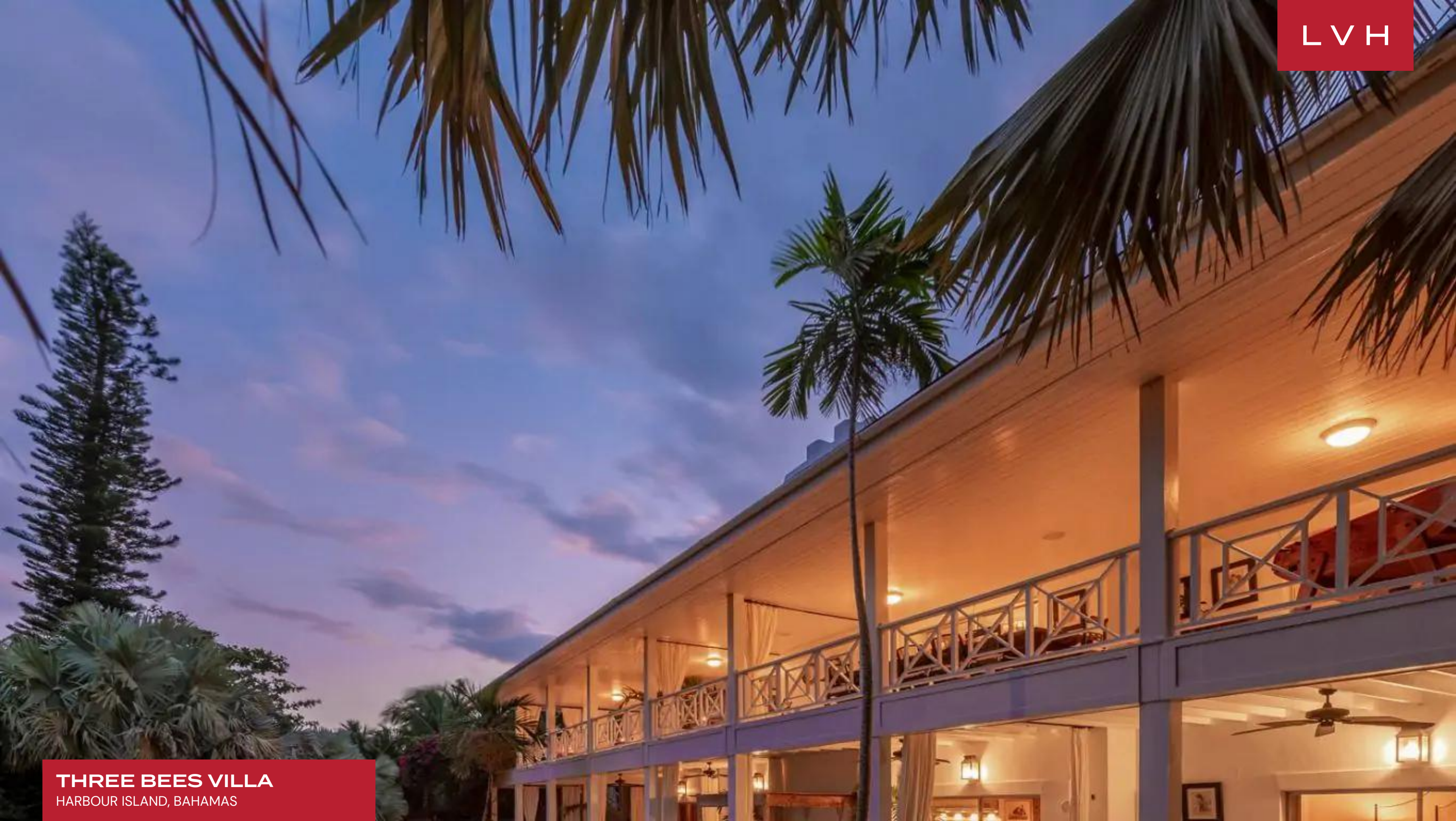
THREE BEES VILLA HARBOUR ISLAND, BAHAMAS