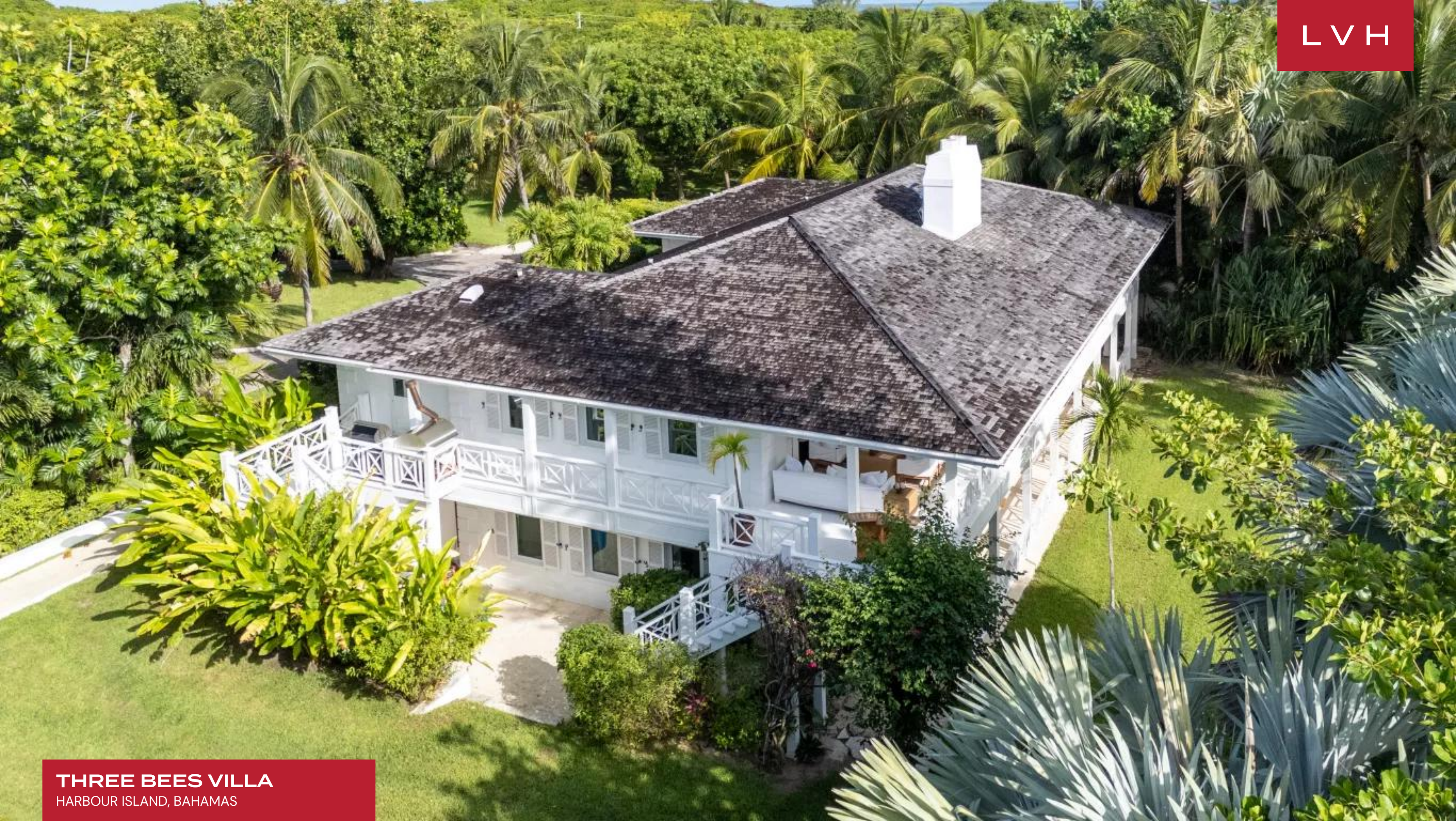
THREE BEES VILLA HARBOUR ISLAND, BAHAMAS