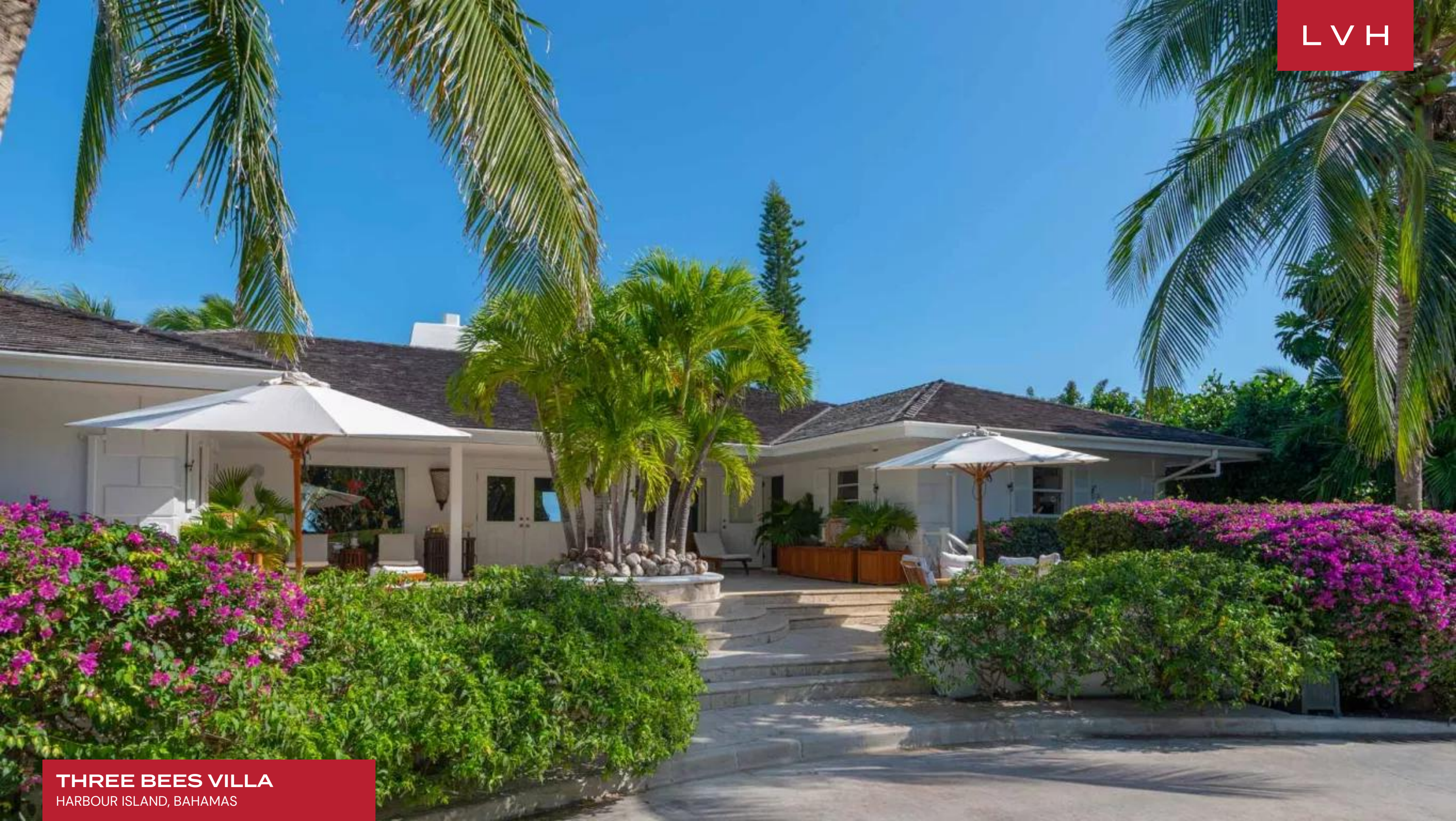
THREE BEES VILLA HARBOUR ISLAND, BAHAMAS