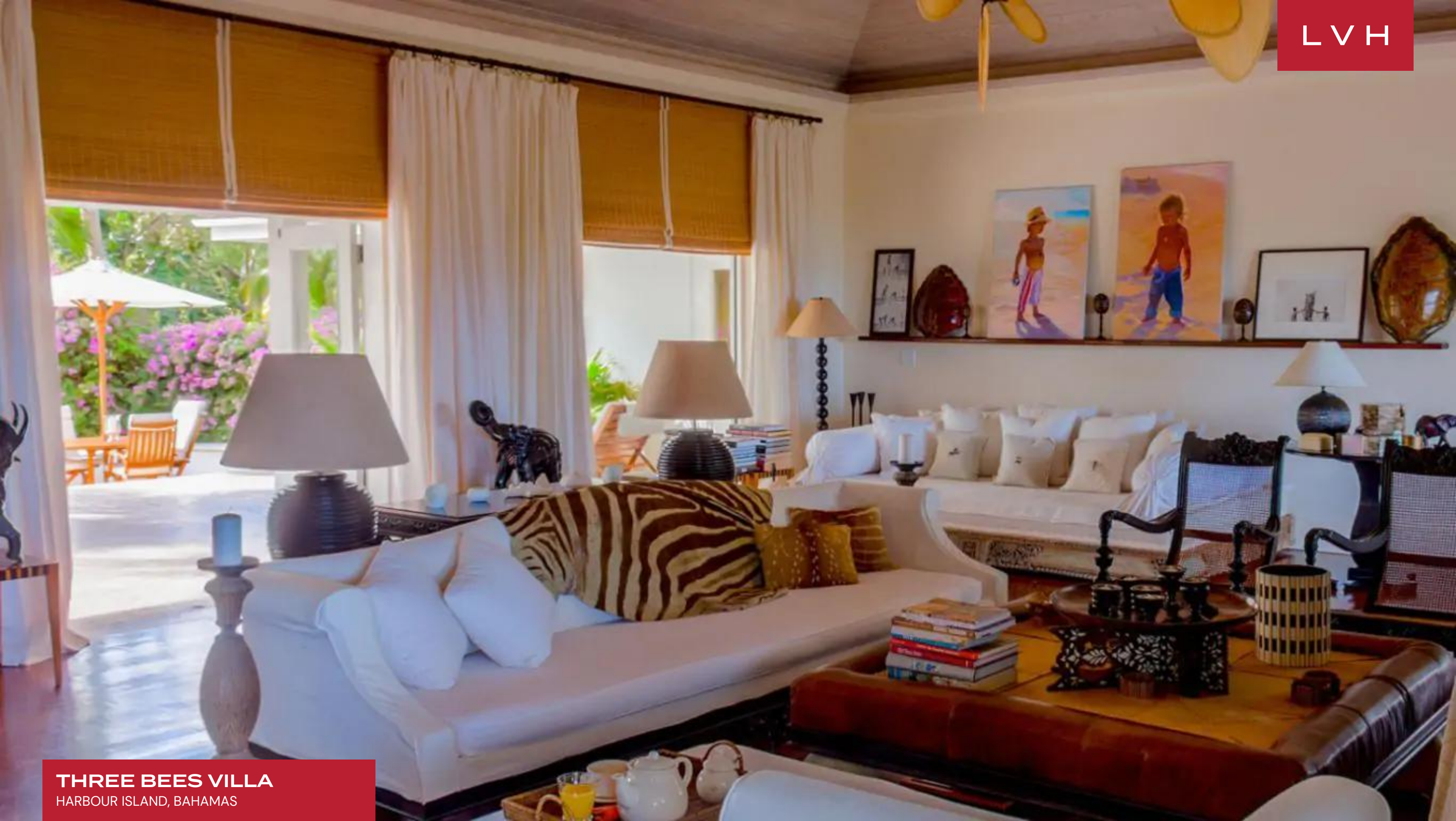
THREE BEES VILLA HARBOUR ISLAND, BAHAMAS