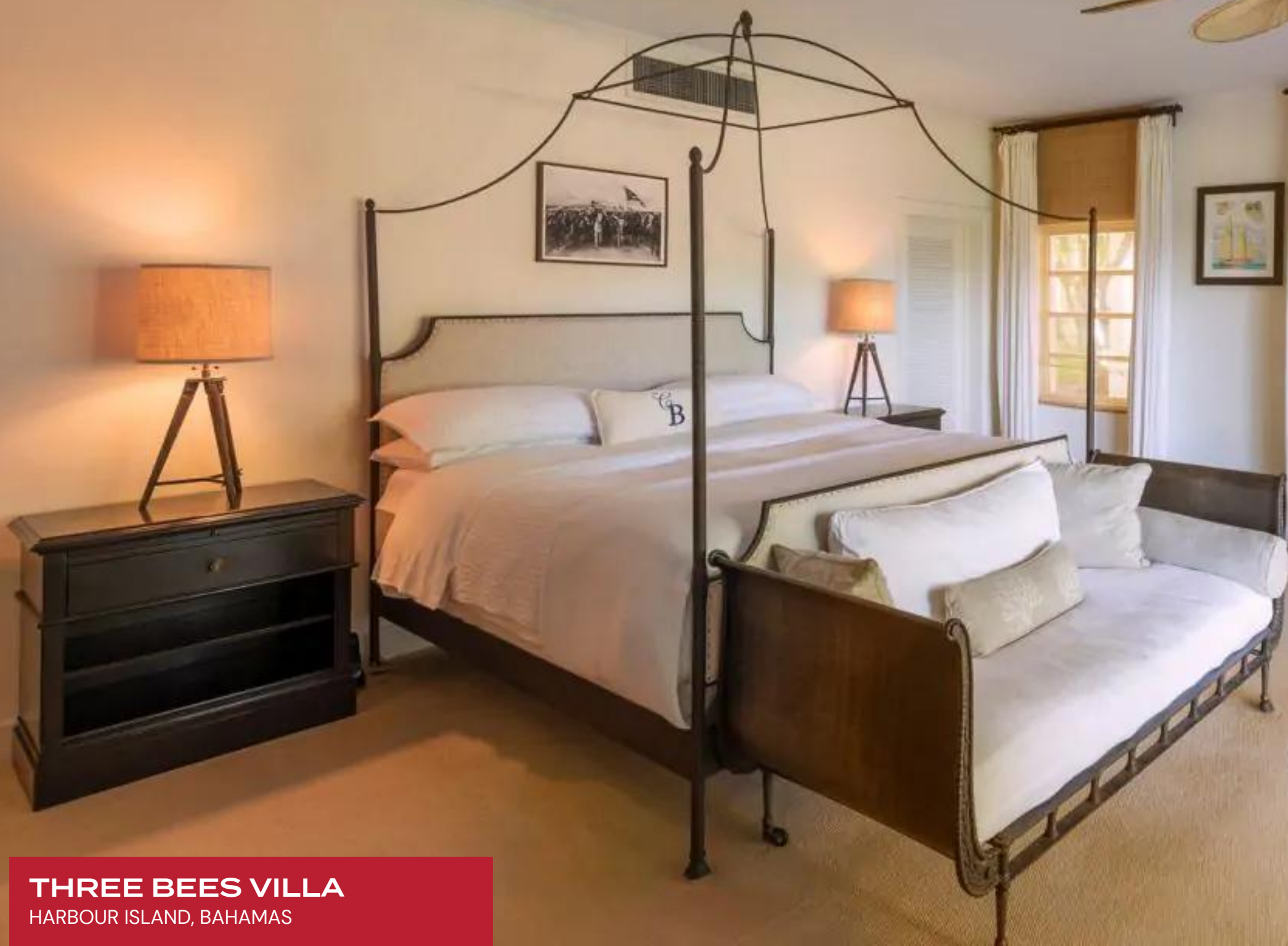
THREE BEES VILLA HARBOUR ISLAND, BAHAMAS