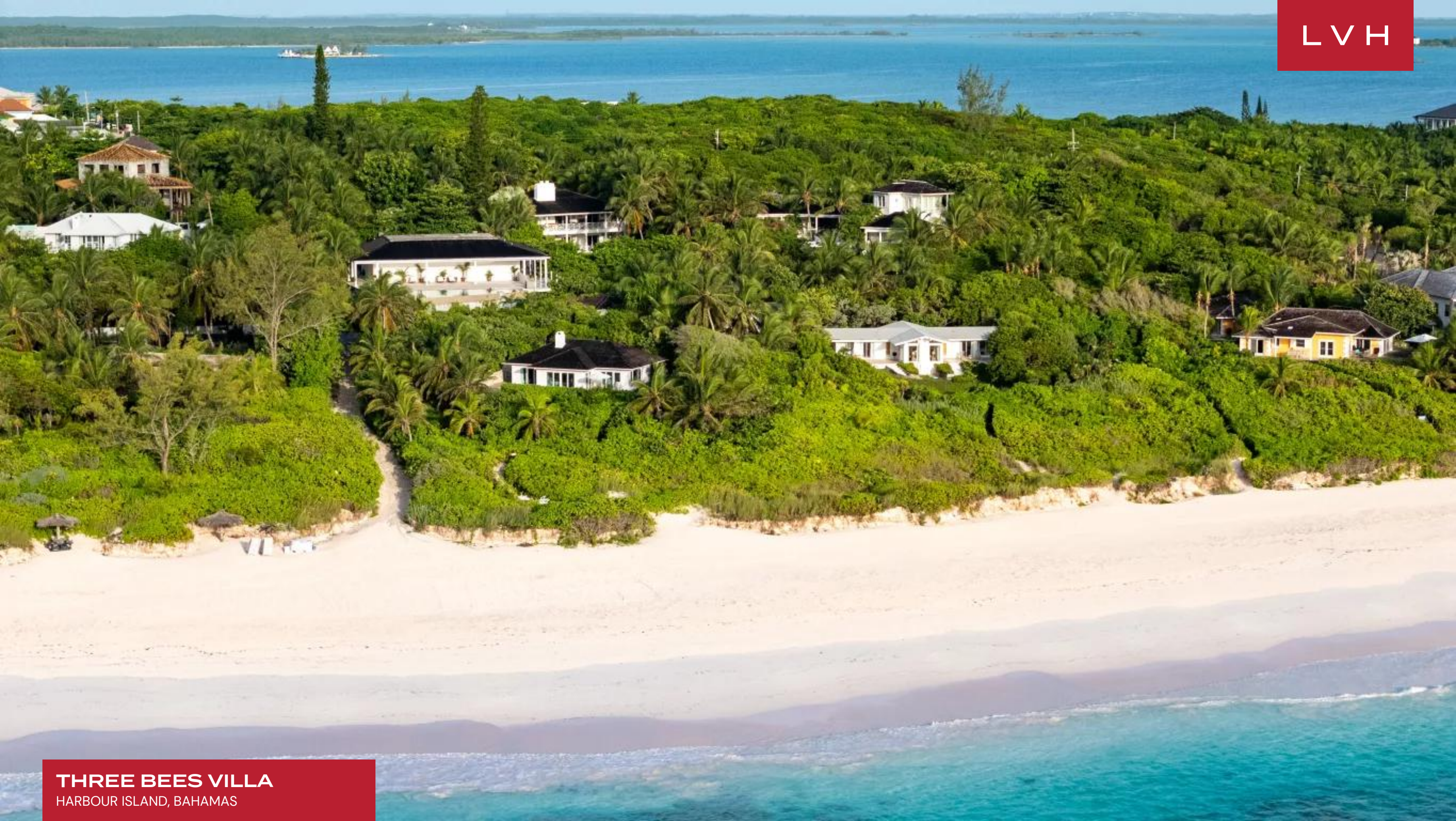
THREE BEES VILLA HARBOUR ISLAND, BAHAMAS