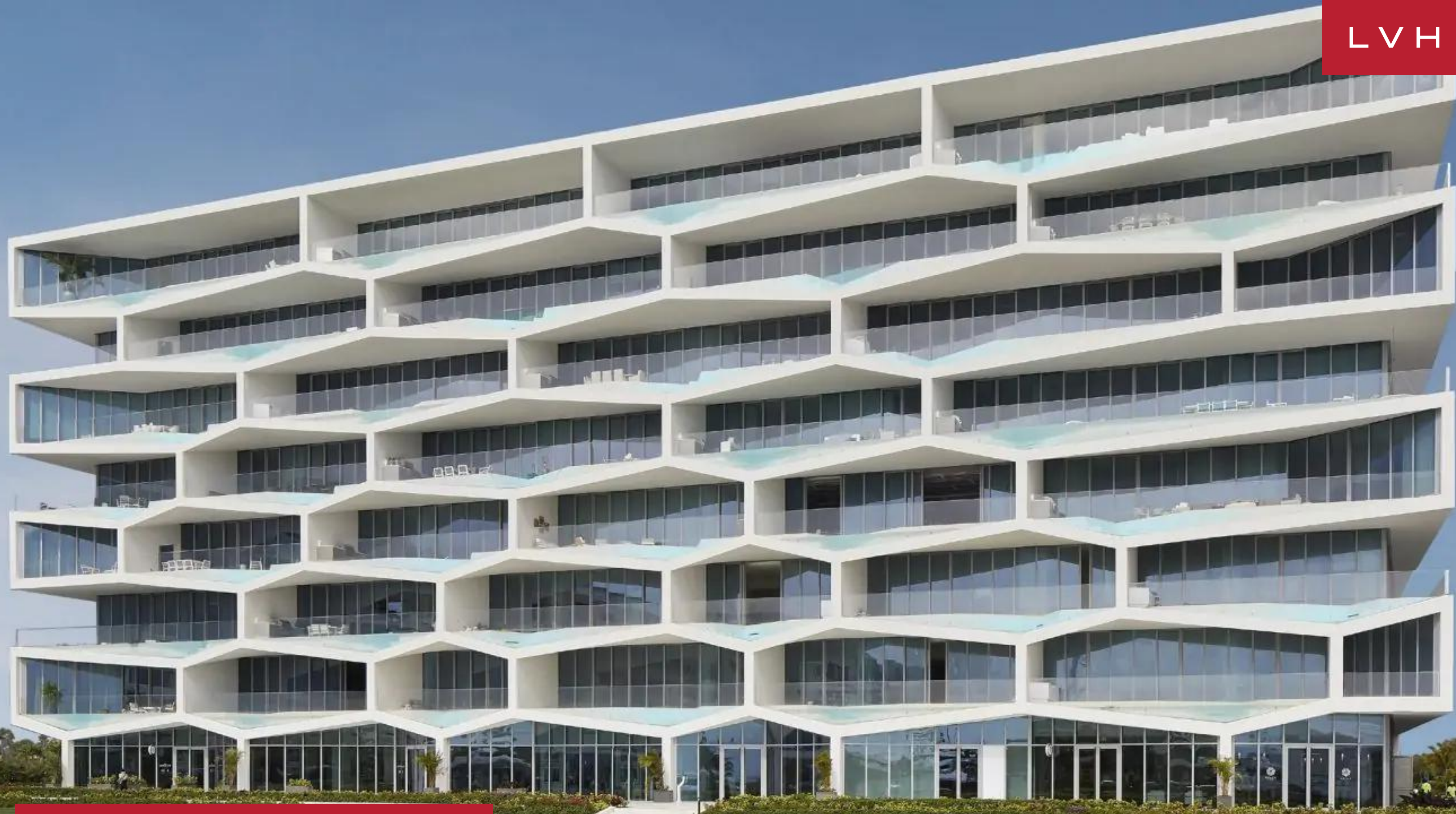
APARTMENT JULIAN ALBANY NEW PROVIDENCE ISLAND, BAHAMAS