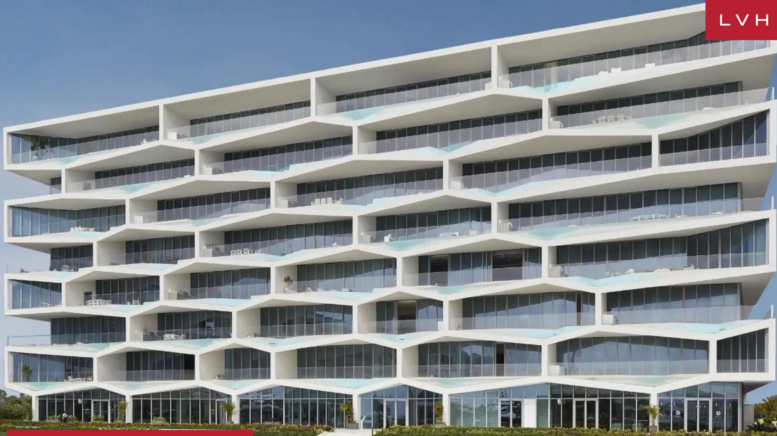
APARTMENT JAMES ALBANY NEW PROVIDENCE ISLAND, BAHAMAS