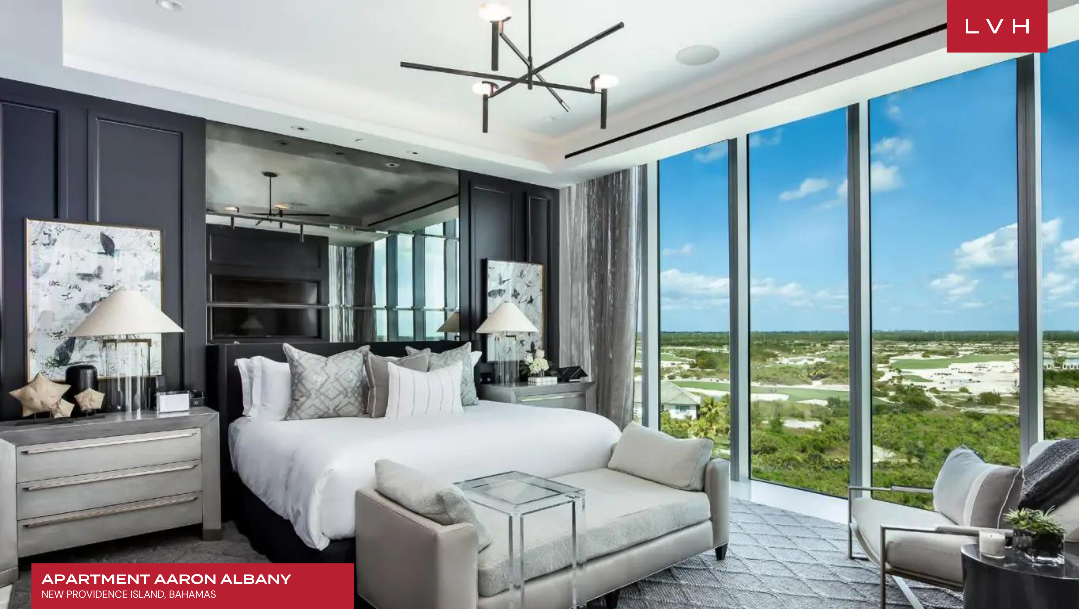
APARTMENT AARON ALBANY NEW PROVIDENCE ISLAND, BAHAMAS