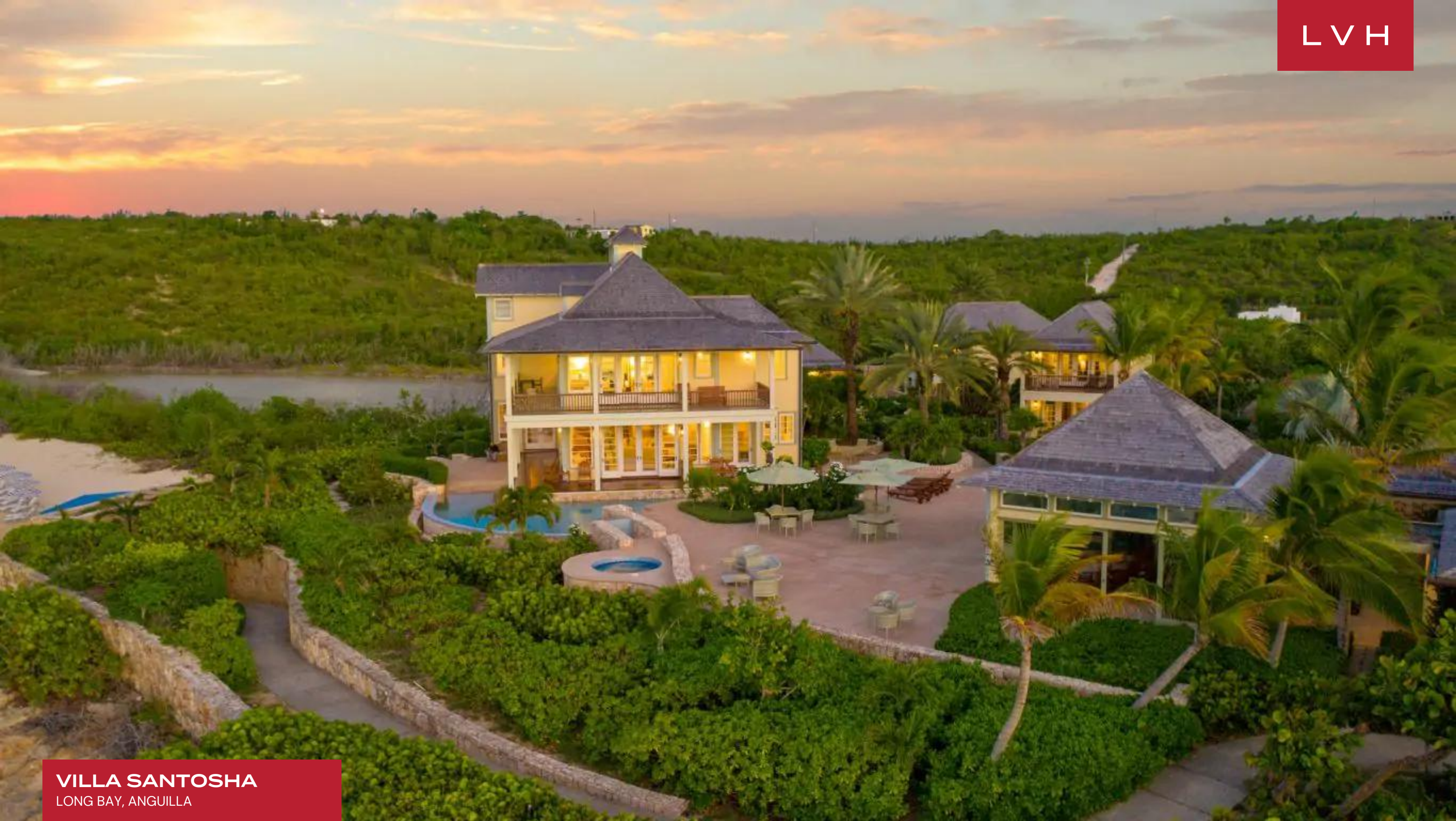
VILLA SANTOSHA LONG BAY, ANGUILLA