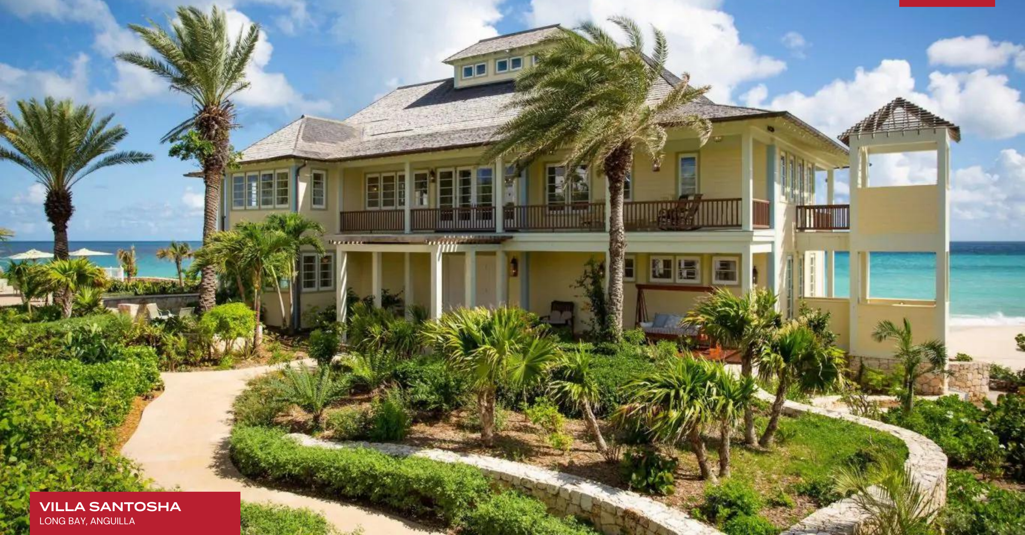
VILLA SANTOSHA LONG BAY, ANGUILLA