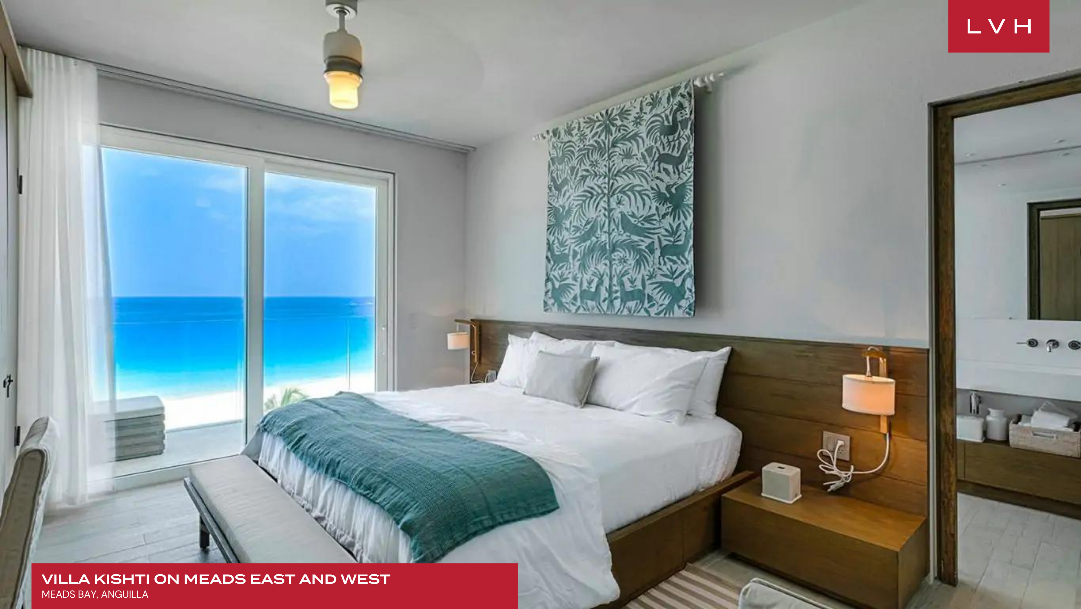
VILLA KISHTI ON MEADS EAST AND WEST MEADS BAY, ANGUILLA