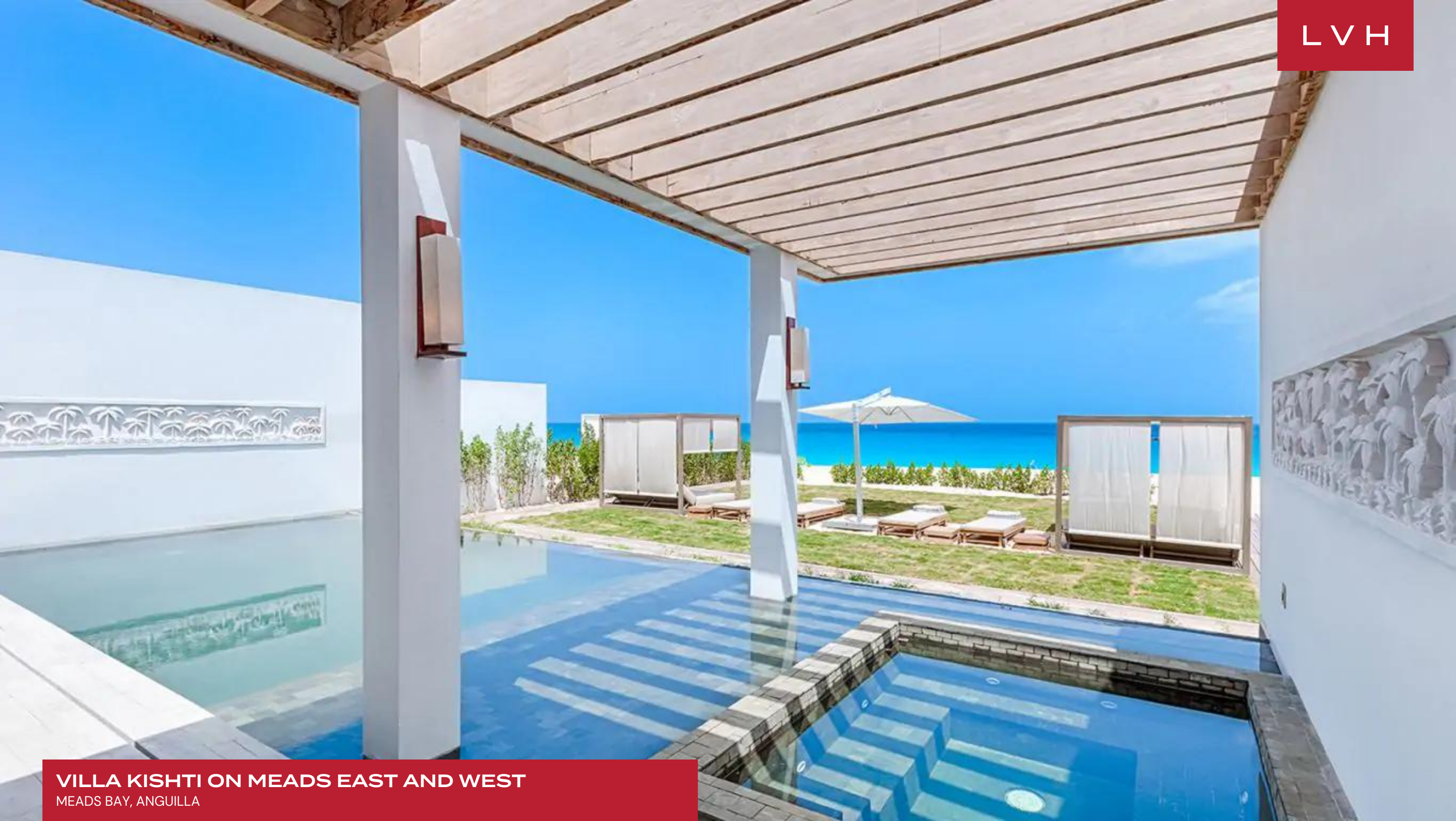
VILLA KISHTI ON MEADS EAST AND WEST MEADS BAY, ANGUILLA