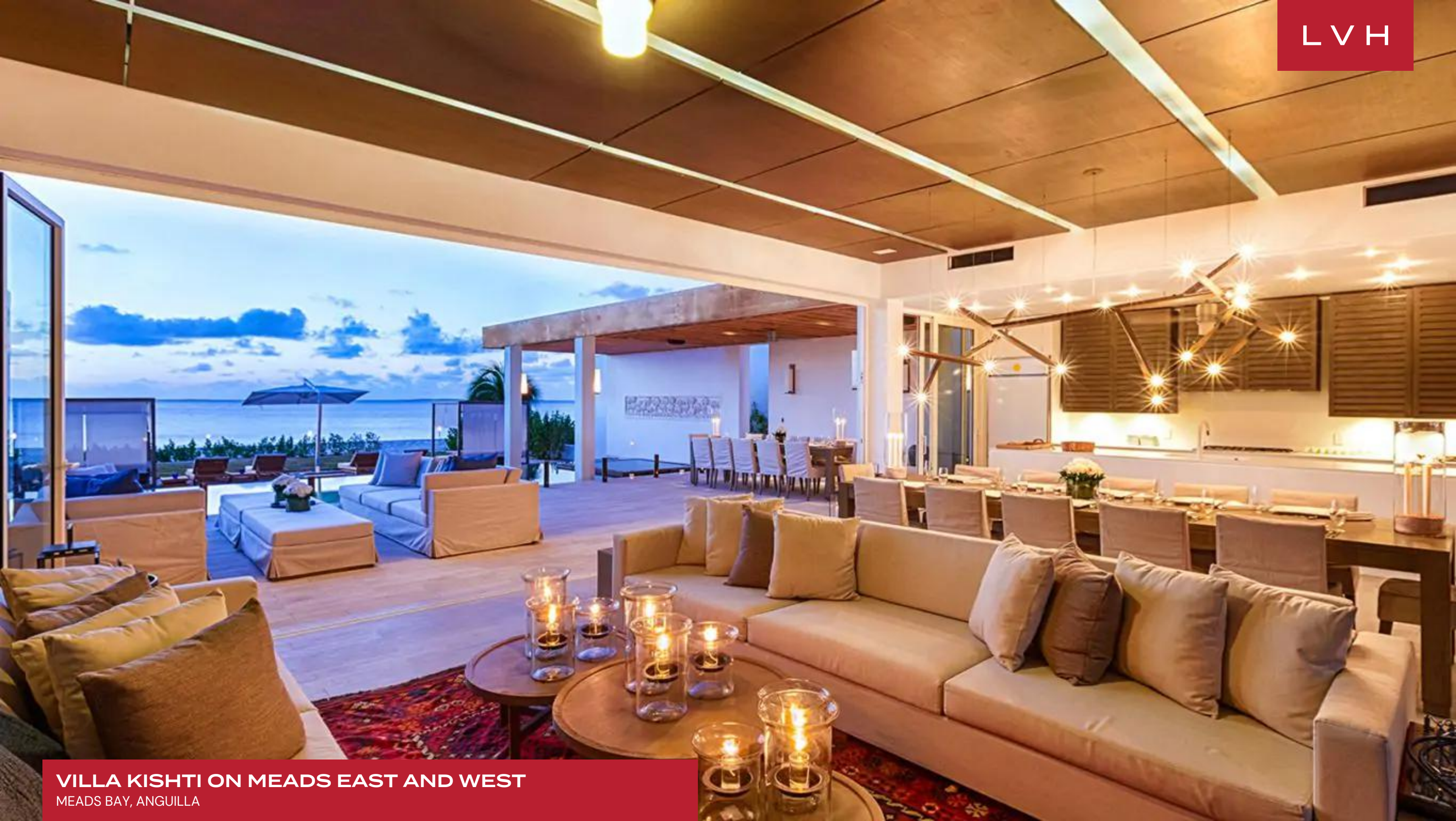
VILLA KISHTI ON MEADS EAST AND WEST MEADS BAY, ANGUILLA