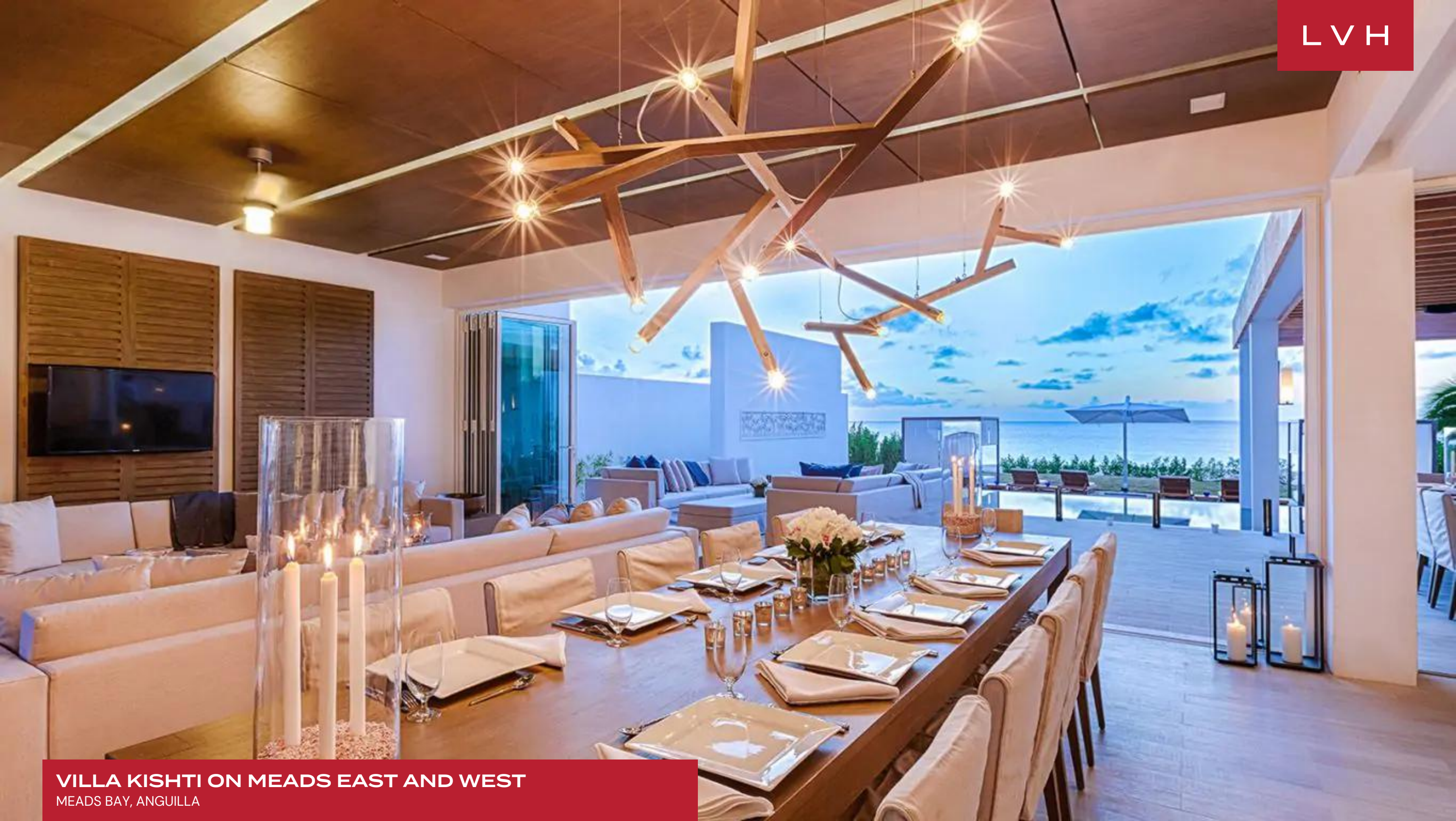
VILLA KISHTI ON MEADS EAST AND WEST MEADS BAY, ANGUILLA