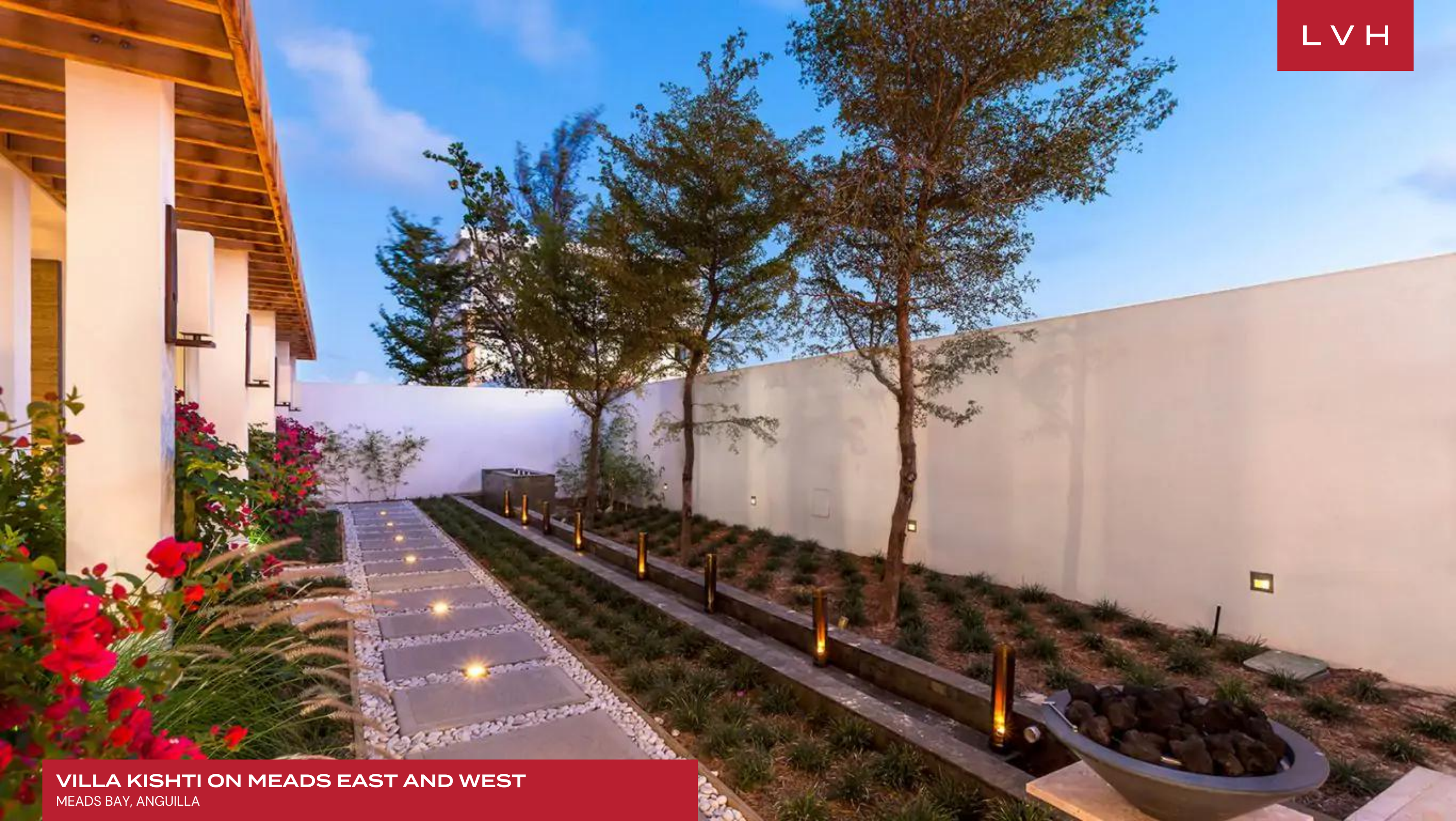
VILLA KISHTI ON MEADS EAST AND WEST MEADS BAY, ANGUILLA