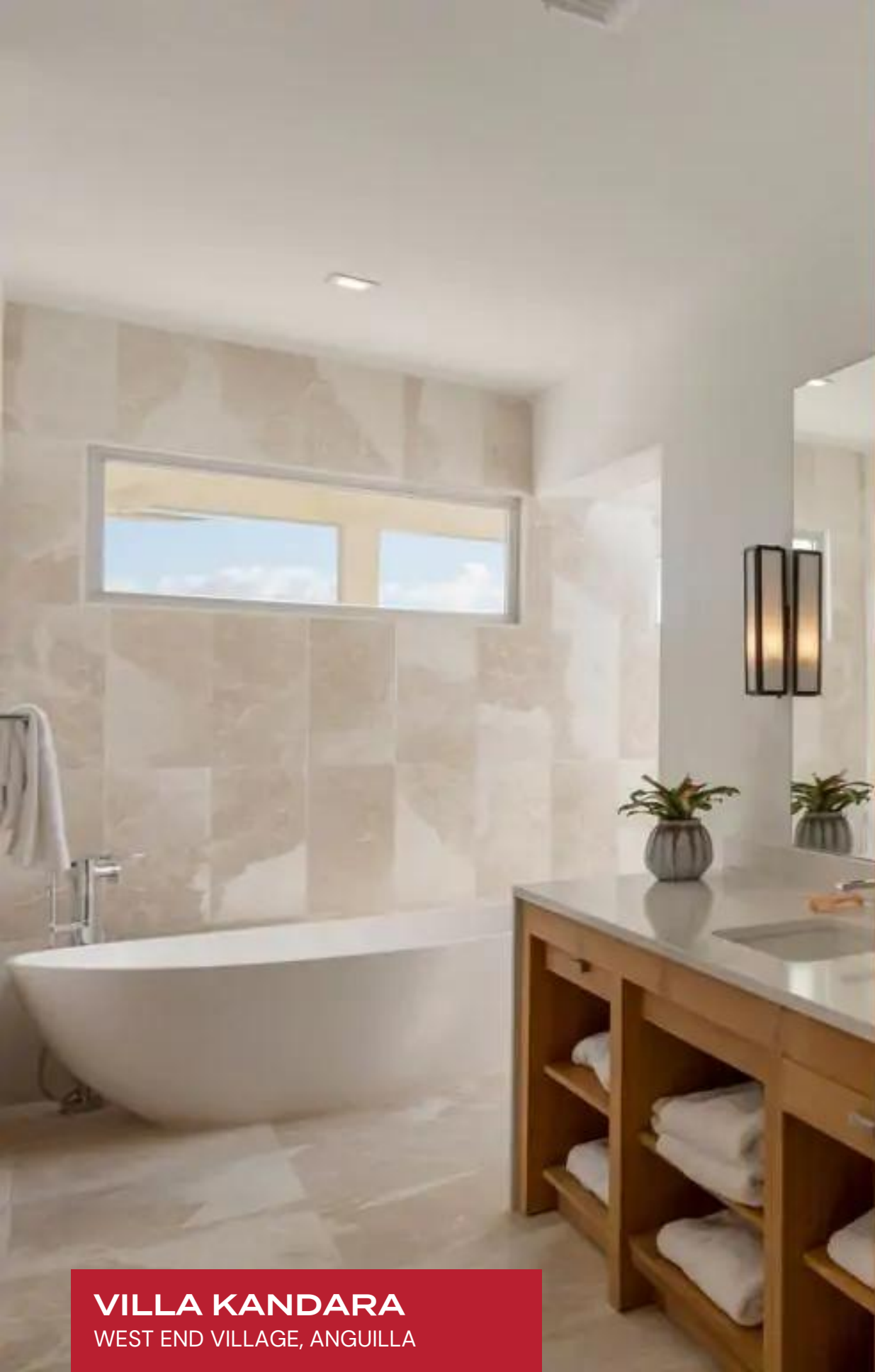
VILLA KANDARA WEST END VILLAGE, ANGUILLA