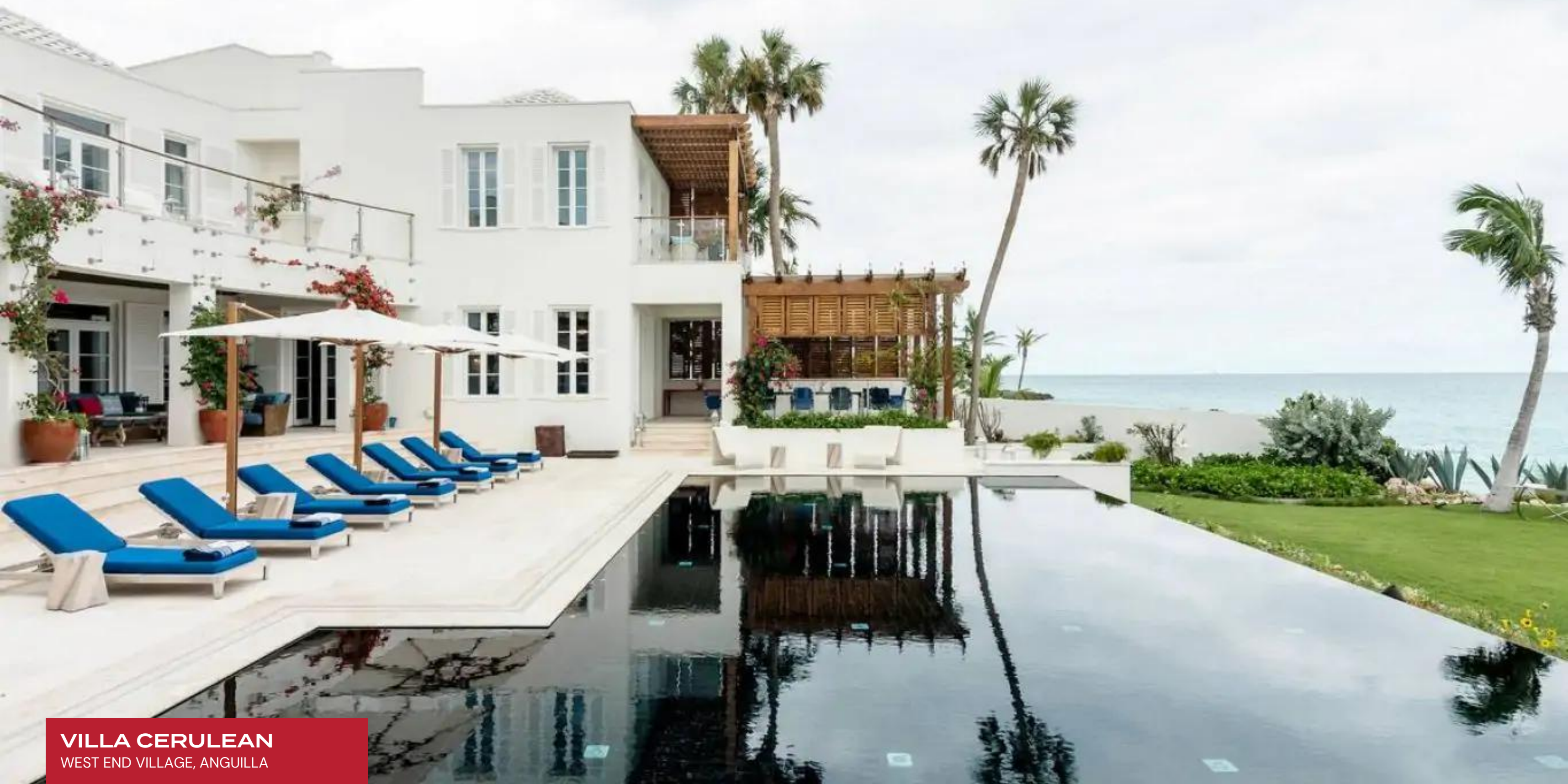
VILLA CERULEAN WEST END VILLAGE, ANGUILLA