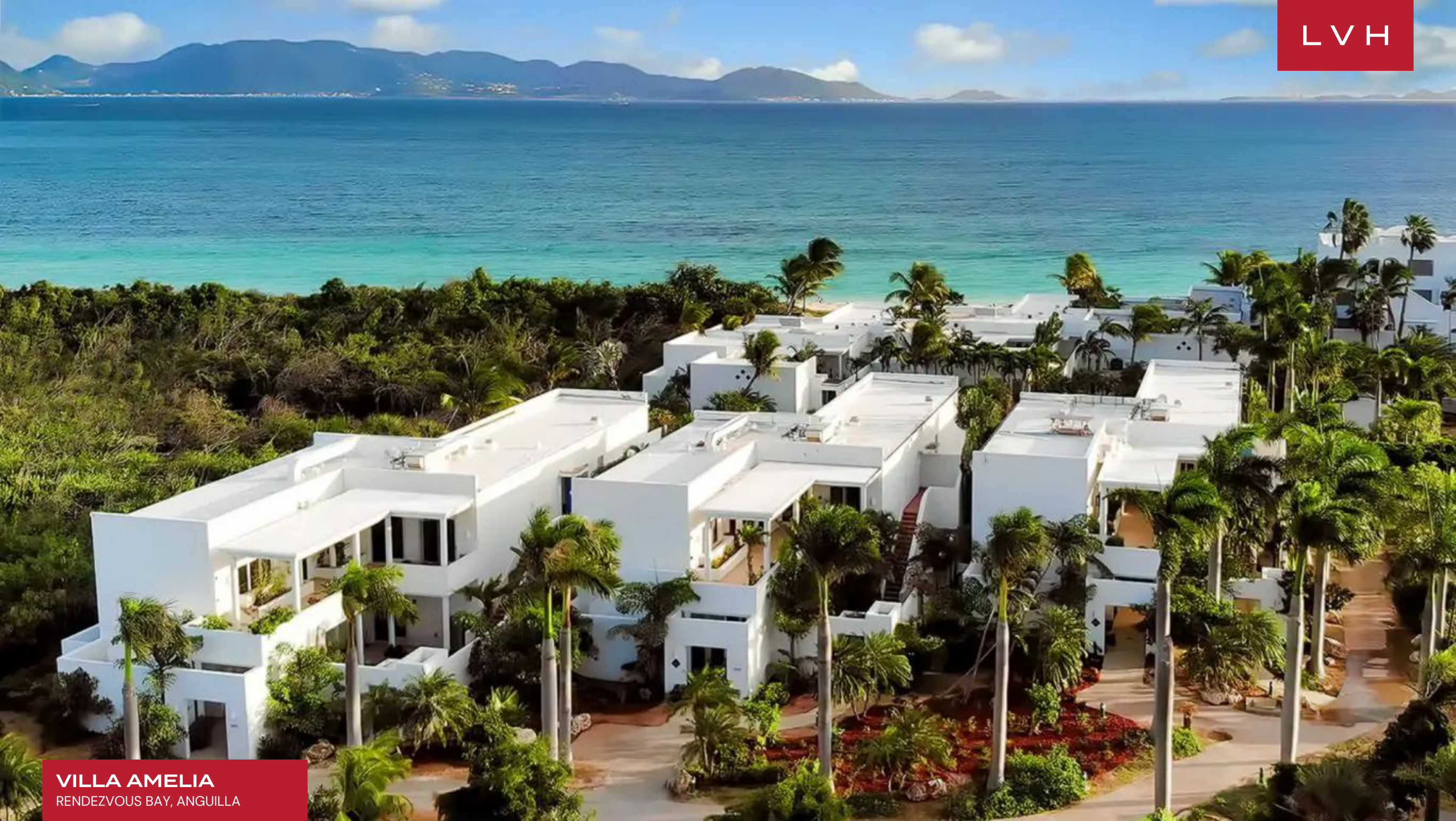
VILLA AMELIA RENDEZVOUS BAY, ANGUILLA