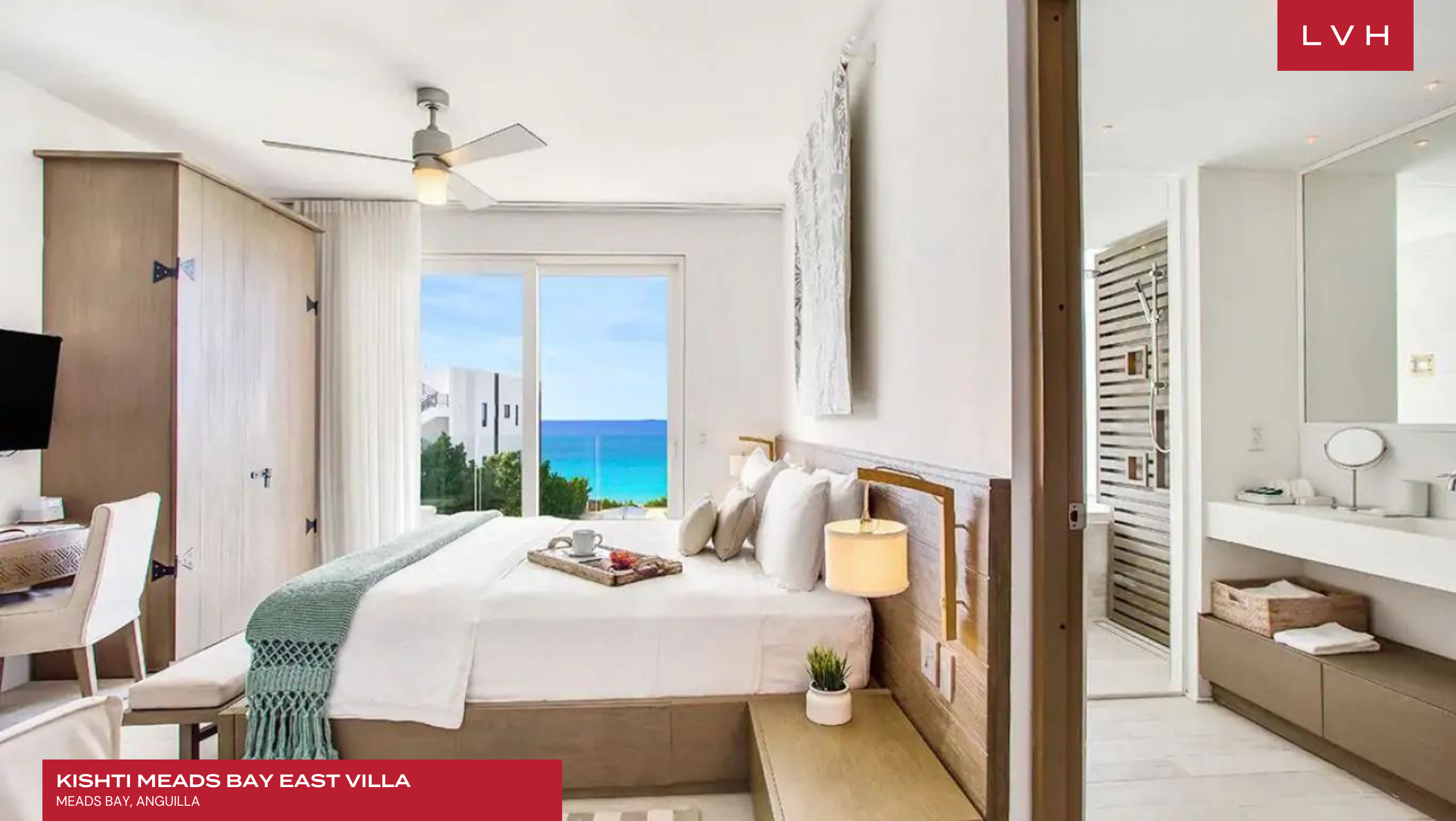
KISHTI MEADS BAY EAST VILLA MEADS BAY, ANGUILLA