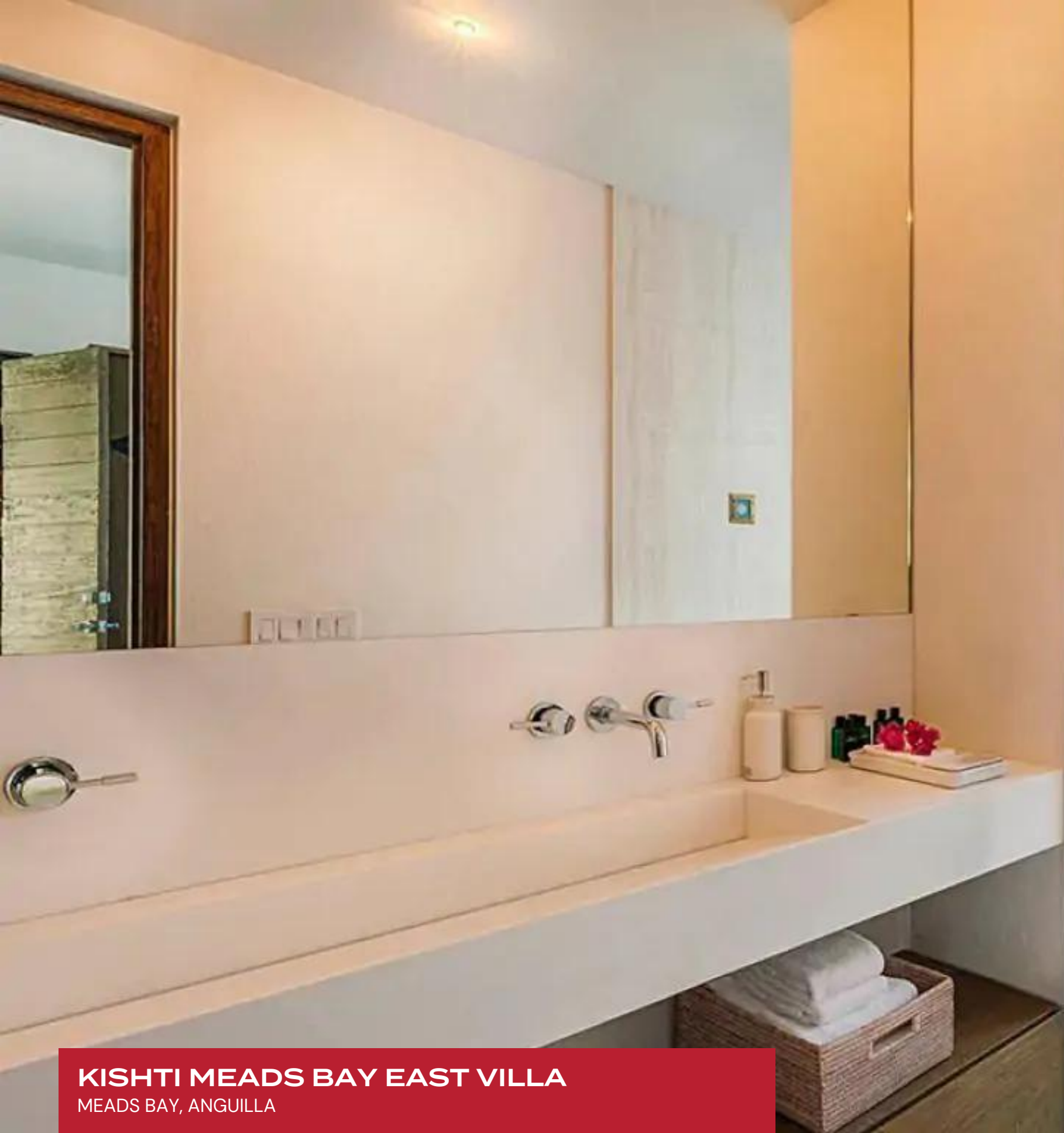
KISHTI MEADS BAY EAST VILLA MEADS BAY, ANGUILLA