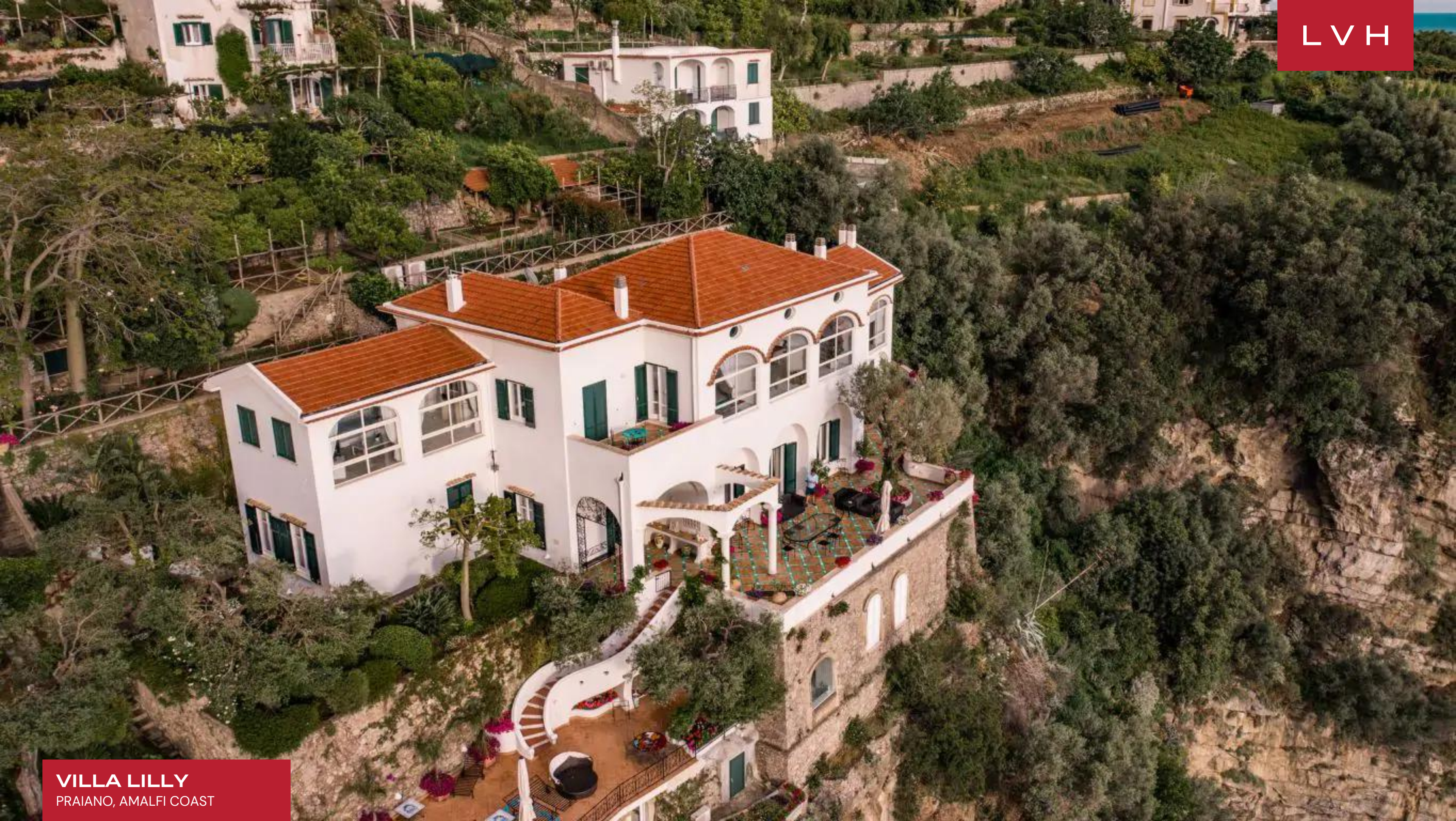
VILLA LILLY PRAIANO, AMALFI COAST