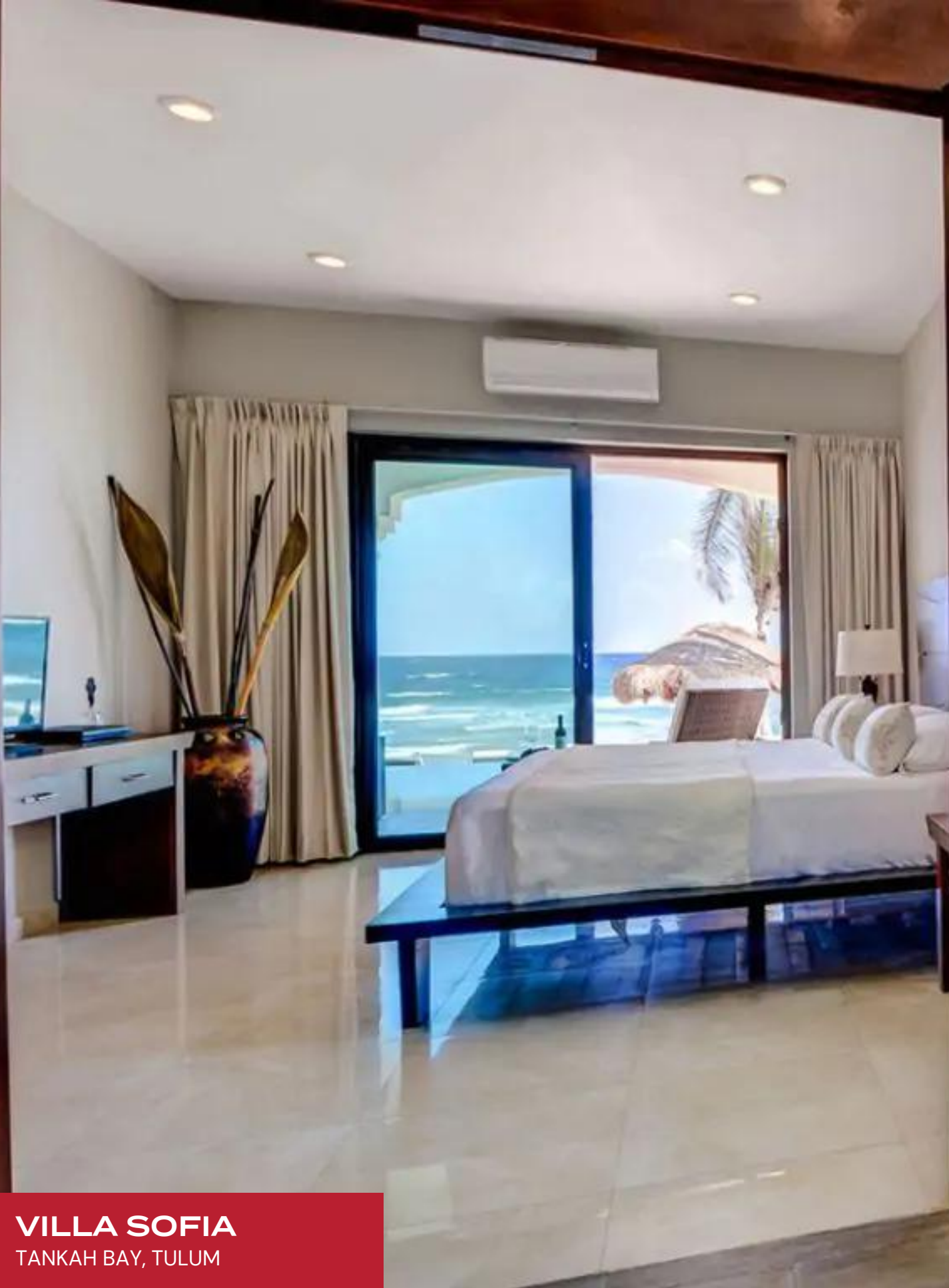
VILLA SOFIA TANKAH BAY, TULUM