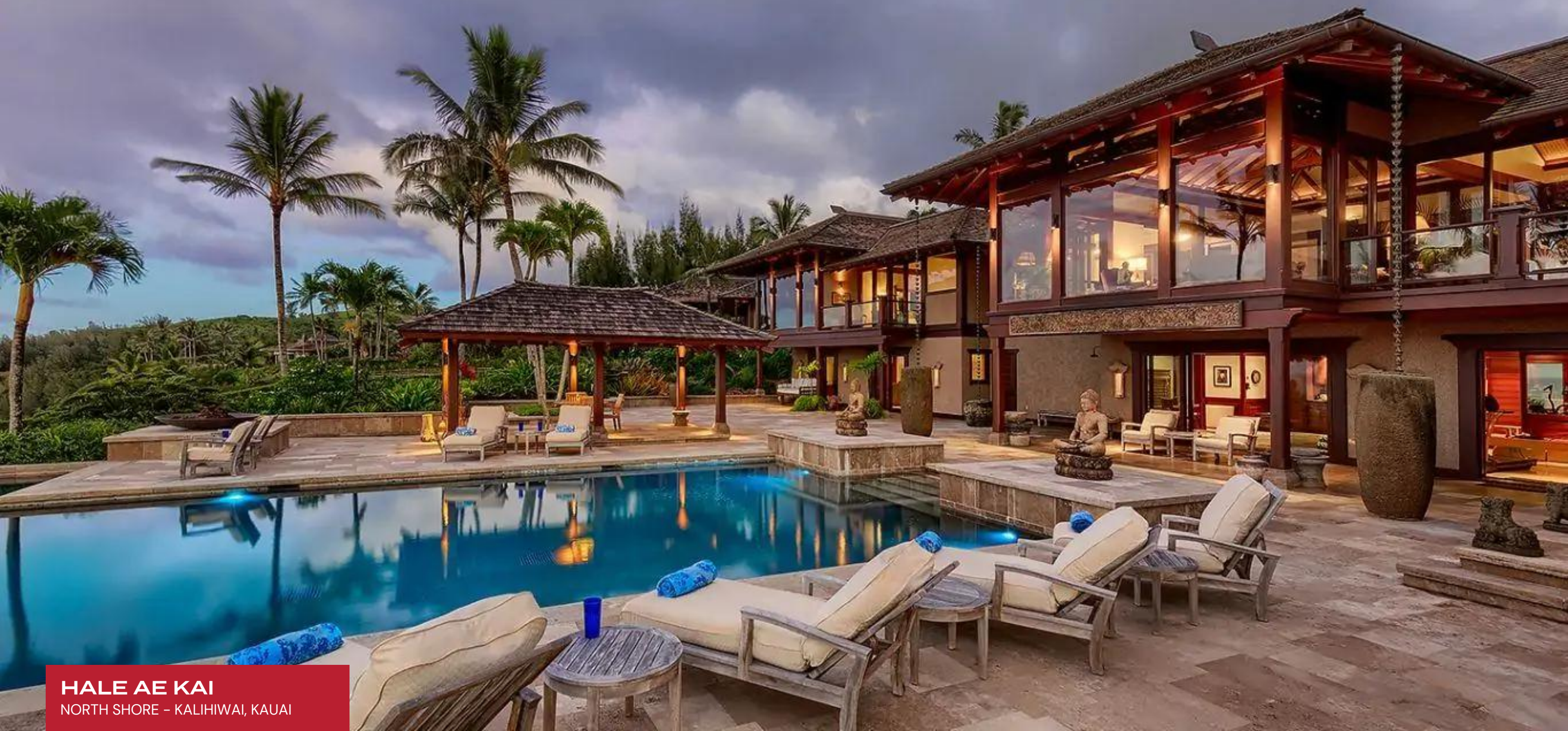
HALE AE KAI NORTH SHORE - KALIHIWAI, KAUAI