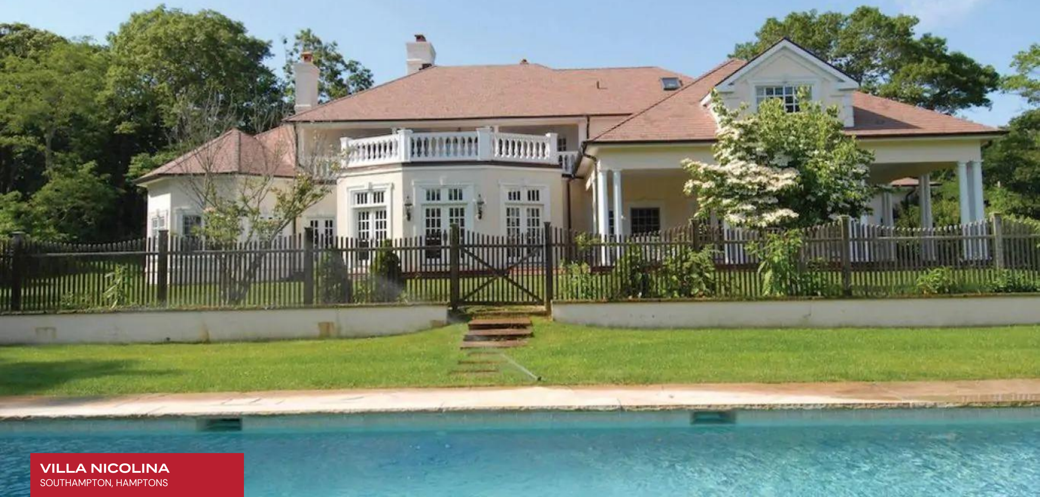
VILLA NICOLINA SOUTHAMPTON, HAMPTONS