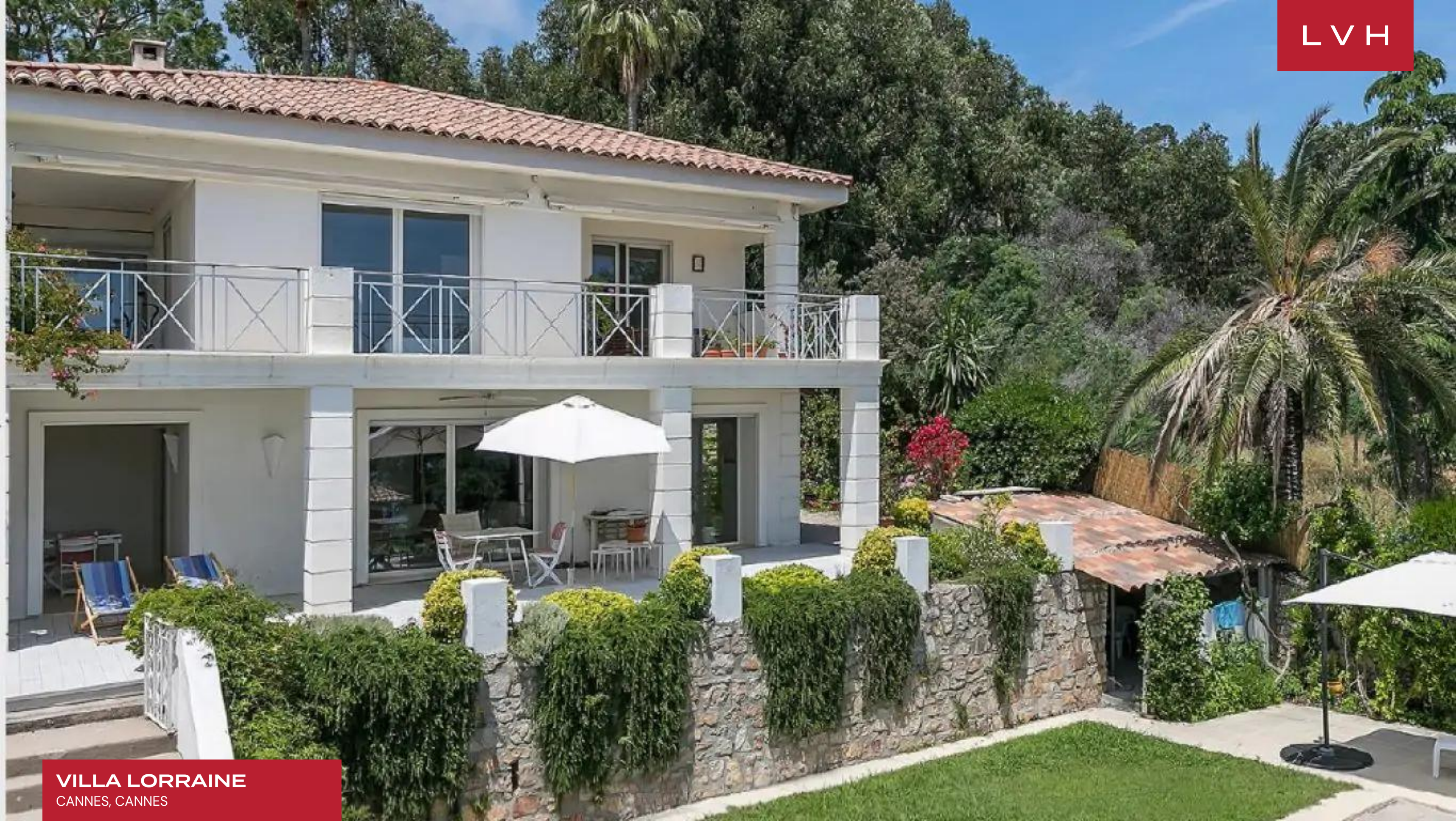
VILLA LORRAINE CANNES, CANNES